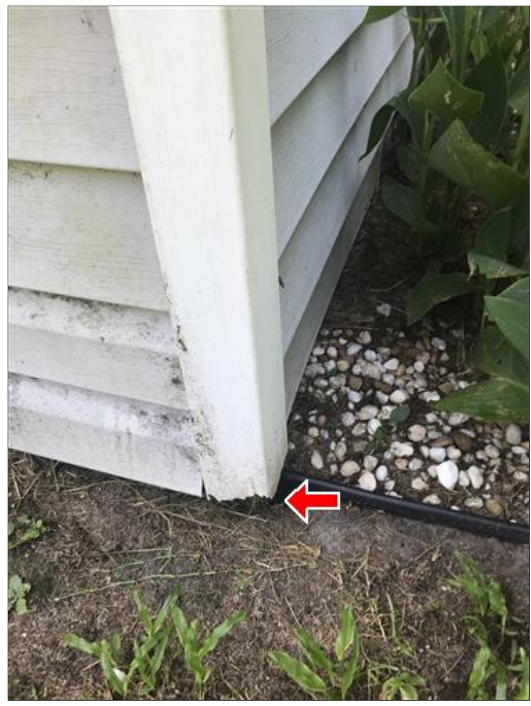
2.0 Picture 1