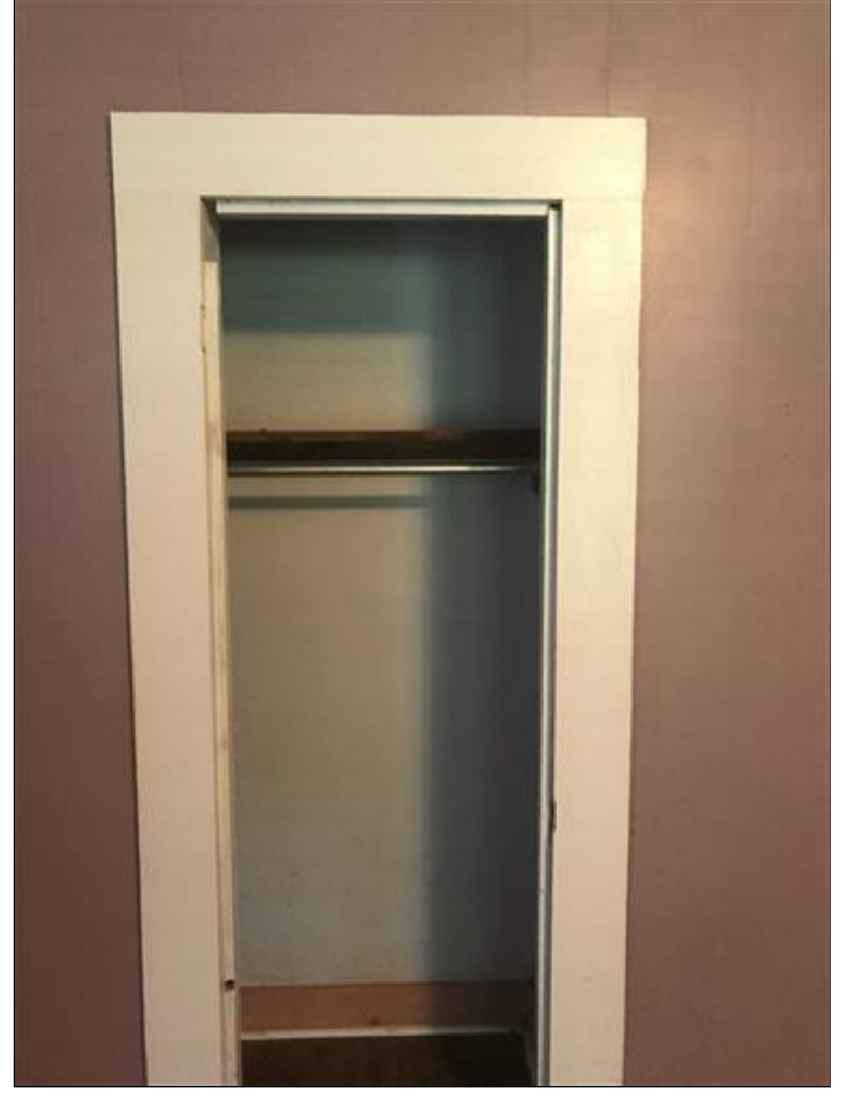
4.5 Picture 1

4.5 The Closet door is missing at the Bedroom. This is a maintenance issue and is for your information. .