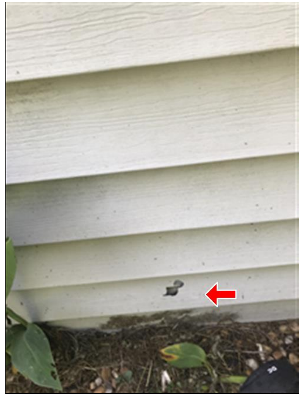
2.0 Picture 2