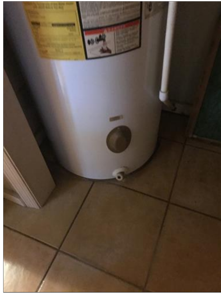
6.2 Picture 1