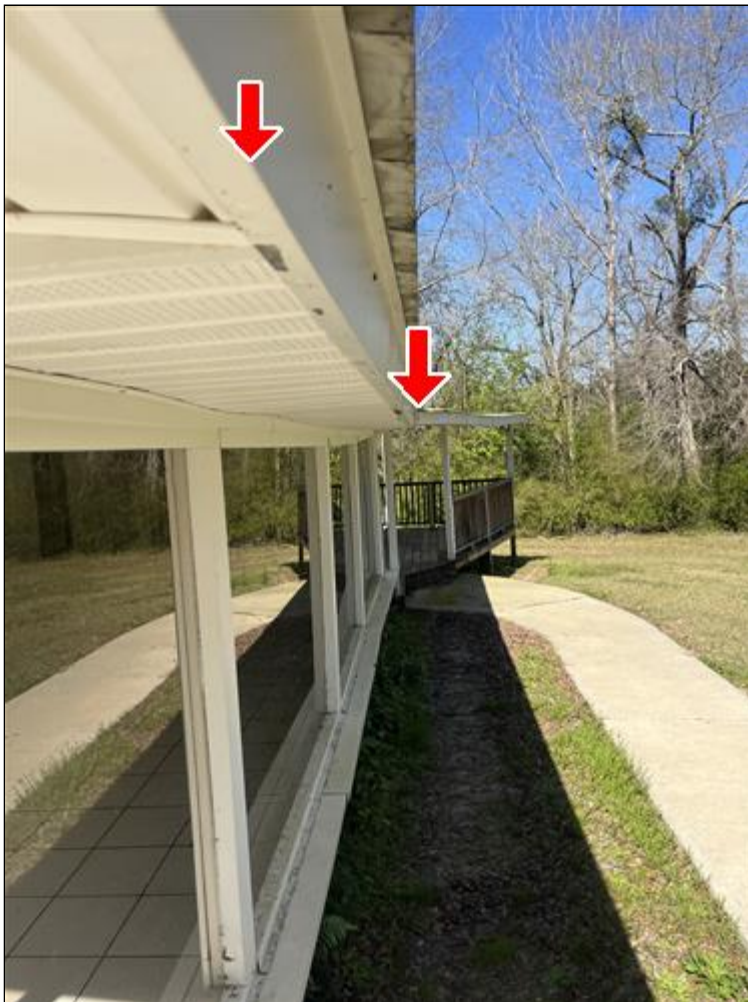
2.5 Picture 1

2.5 The fascia at the rear of the home sags in areas, this may be due to settlement at the rear of the home. I am unable to inspect the rafters in this area. This is for your information.