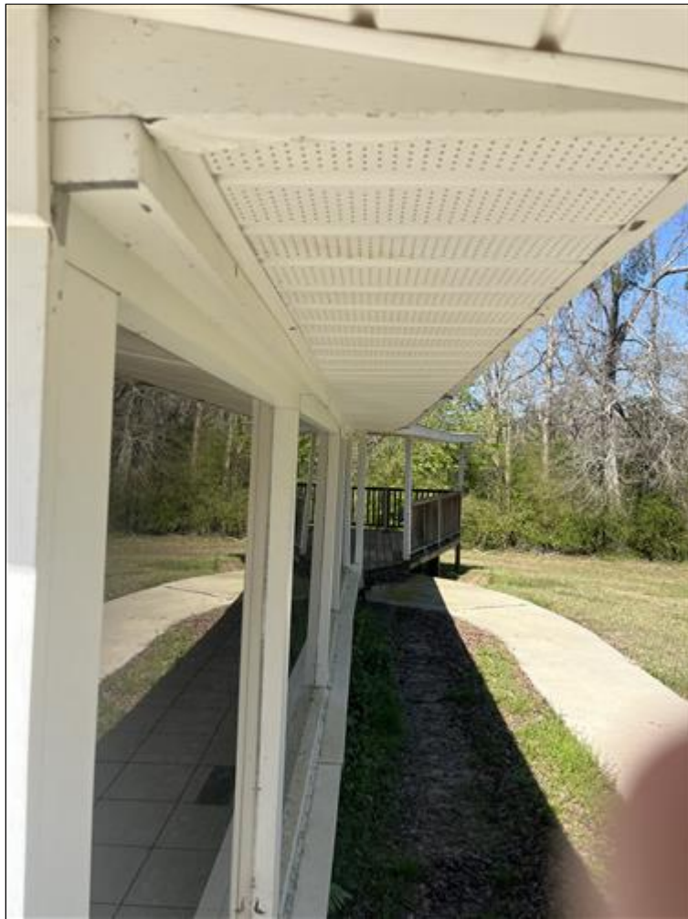
2.5 Picture 2

The exterior of the home was inspected and reported on with the above information. While the inspector makes every effort to find all areas of concern, some areas can go unnoticed. Please be aware that the inspector has your best interest in mind. Any repair items mentioned in this report should be considered before purchase. It is recommended that qualified contractors be used in your further inspection or repair issues as it relates to the comments in this inspection report.