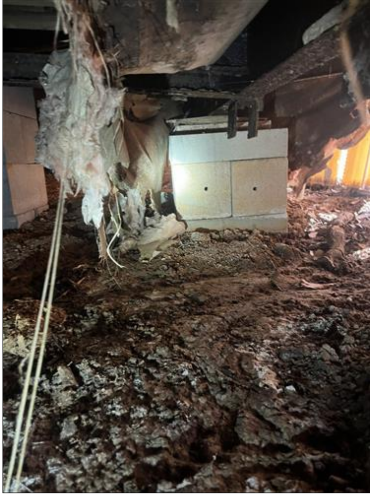
5.2 Picture 2