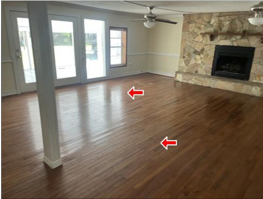
4.2 Picture 2

(2) The Wood covering is curling around edges and is not impervious to water shows wet stains indicating moisture or intrusion did or still may occur at the Living Room. While this damage is cosmetic, the repair cost should be considered due to the amount of damage. A qualified person should repair or replace as needed A qualified contractor should inspect and repair as needed.