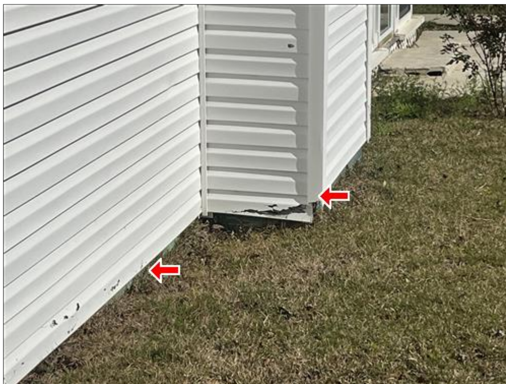
2.0 Picture 1