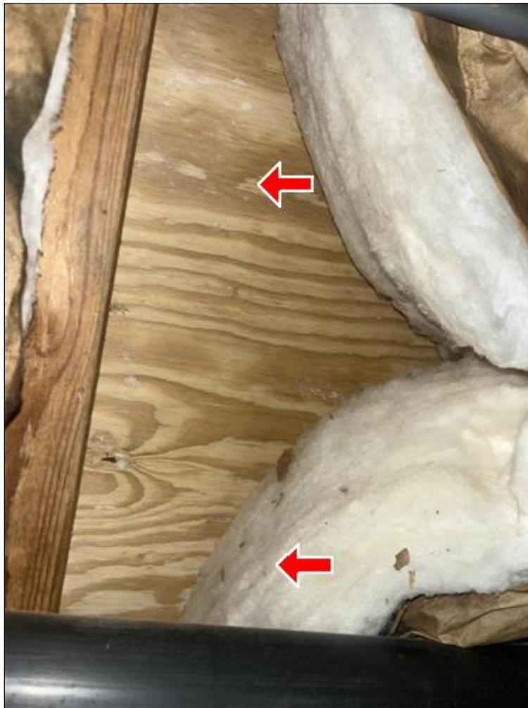
5.3 Picture 3 Past repairs made to the sub-flooring

The structure of the home was inspected and reported on with the above information. While the inspector makes every effort to find all areas of concern, some areas can go unnoticed. Please be aware that the inspector has your best interest in mind. Any repair items mentioned in this report should be considered before purchase. It is recommended that qualified contractors be used in your further inspection or repair issues as it relates to the comments in this inspection report.