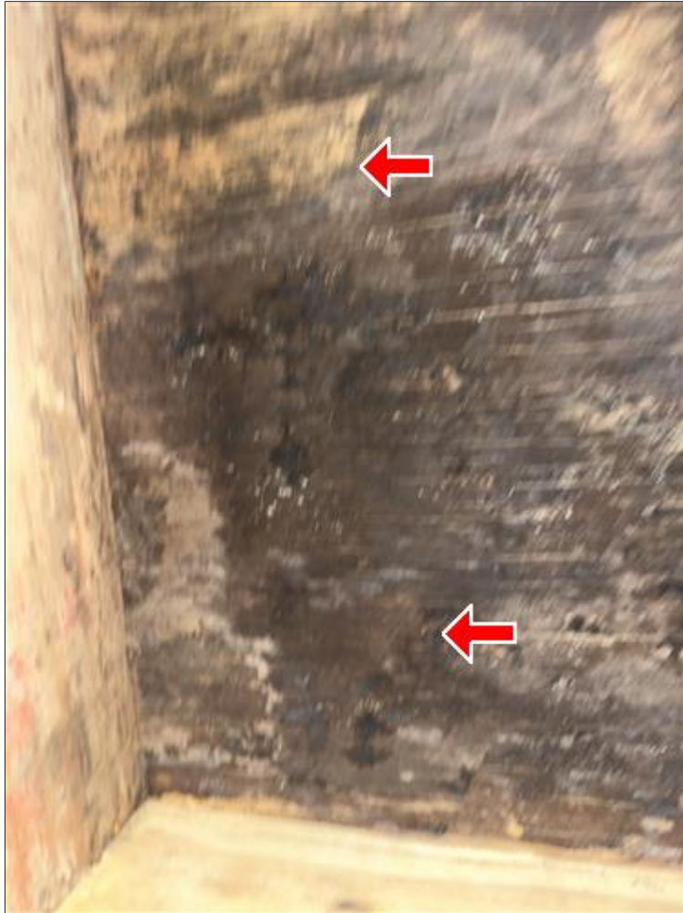
5.2 Picture 3