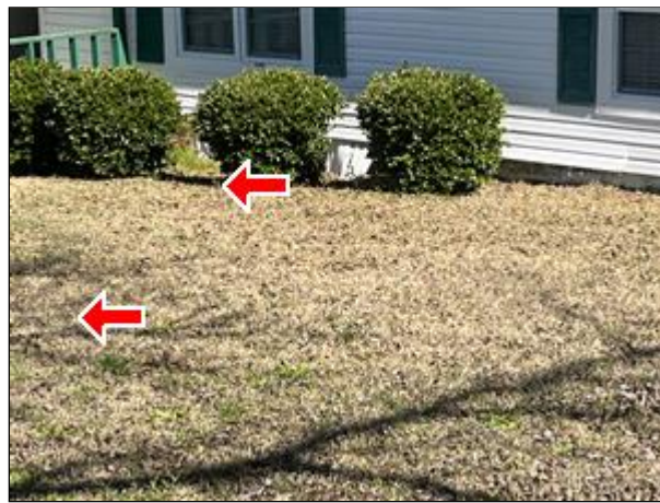
2.4 Picture 2