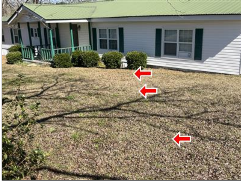
2.4 Picture 1

2.4 There is a negative slope at the front of home and can cause or contribute to water intrusion or deterioration. I recommend correcting landscape to drain water away from home.