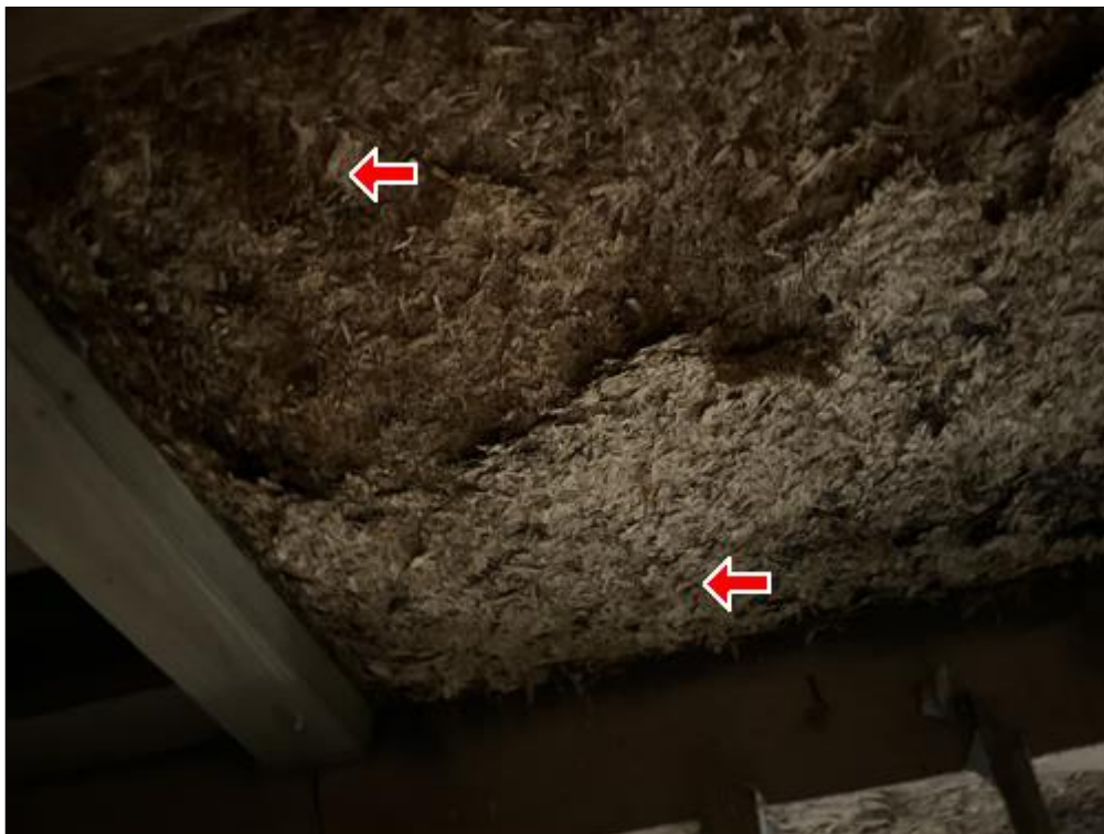
5.3 Picture 2