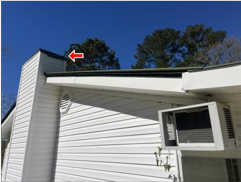
1.2 Picture 1

1.2 The chimney has been closed off at the top with sheet metal and is considered inoperable. It should not be used until inspected for safety by a qualified chimney sweep. I did not inspect for operation.