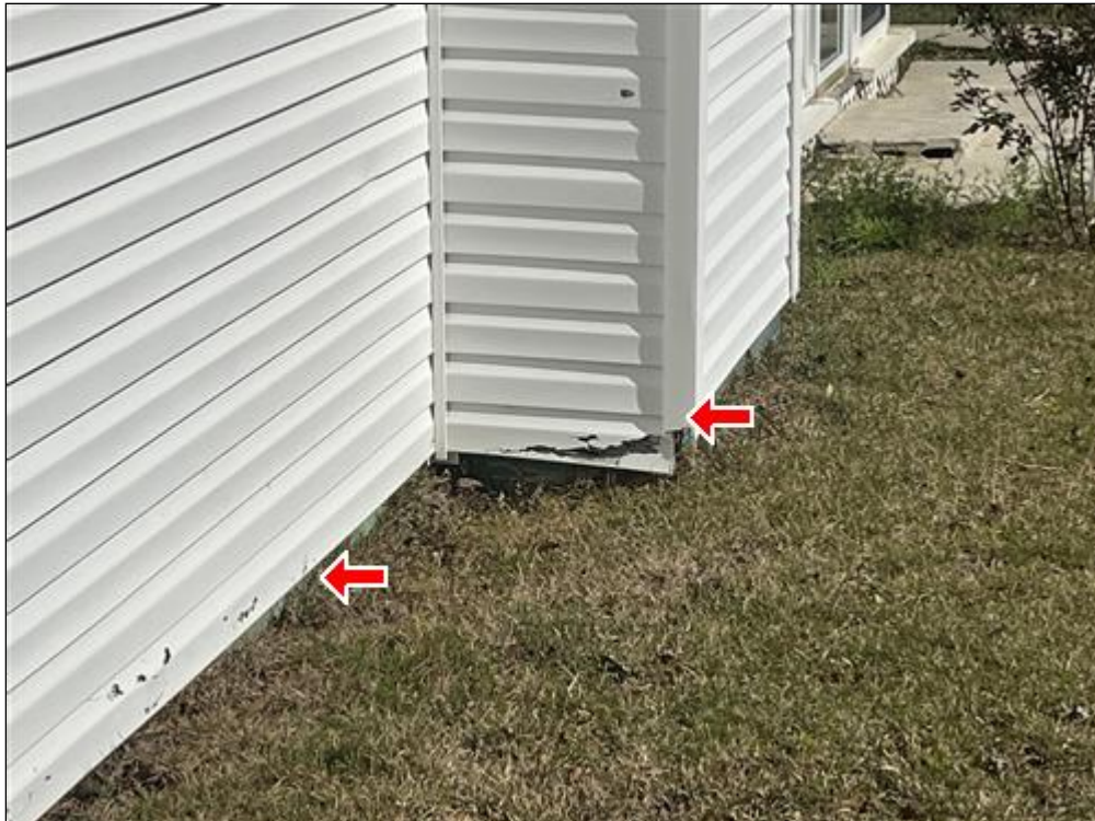
2.0 Picture 1

2.0 The Vinyl siding at the exterior in areas is damaged. . A qualified person should repair or replace as needed.