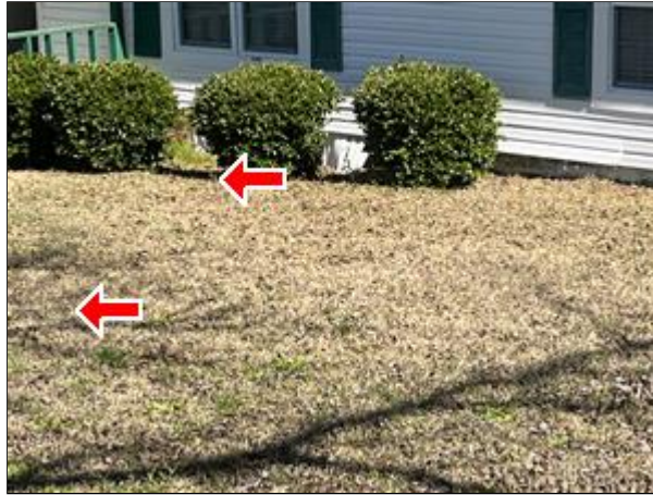
2.4 Picture 2