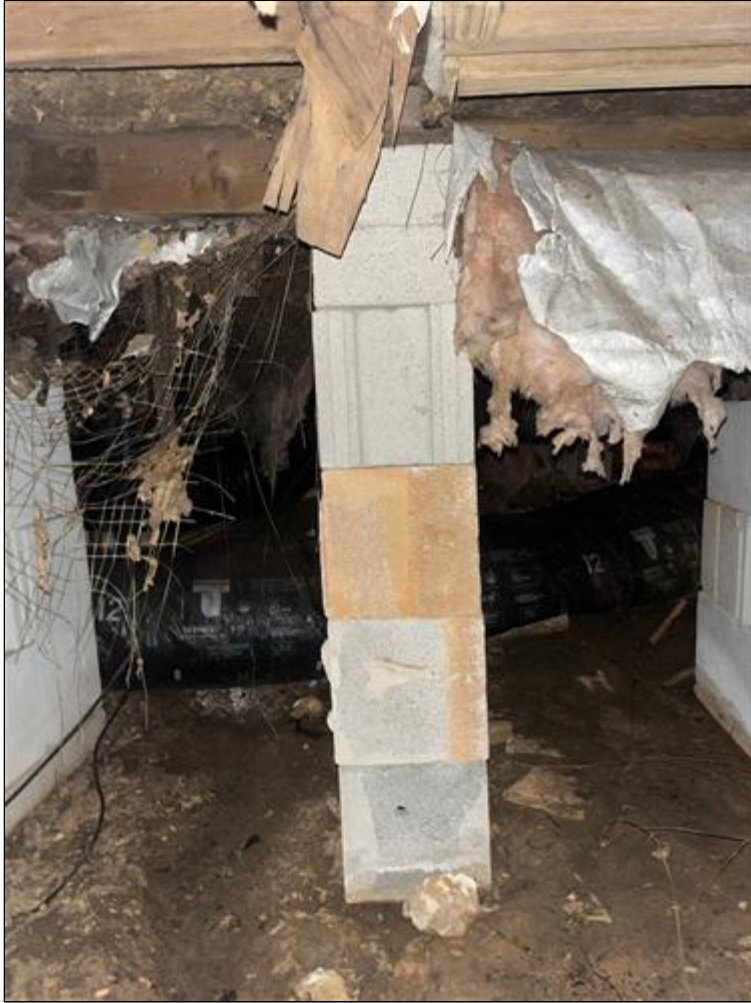
5.2 Picture 1

5.2 There has been some additional piers added since the original construction. There was no footing or mortar between blocks added to these piers when applied.