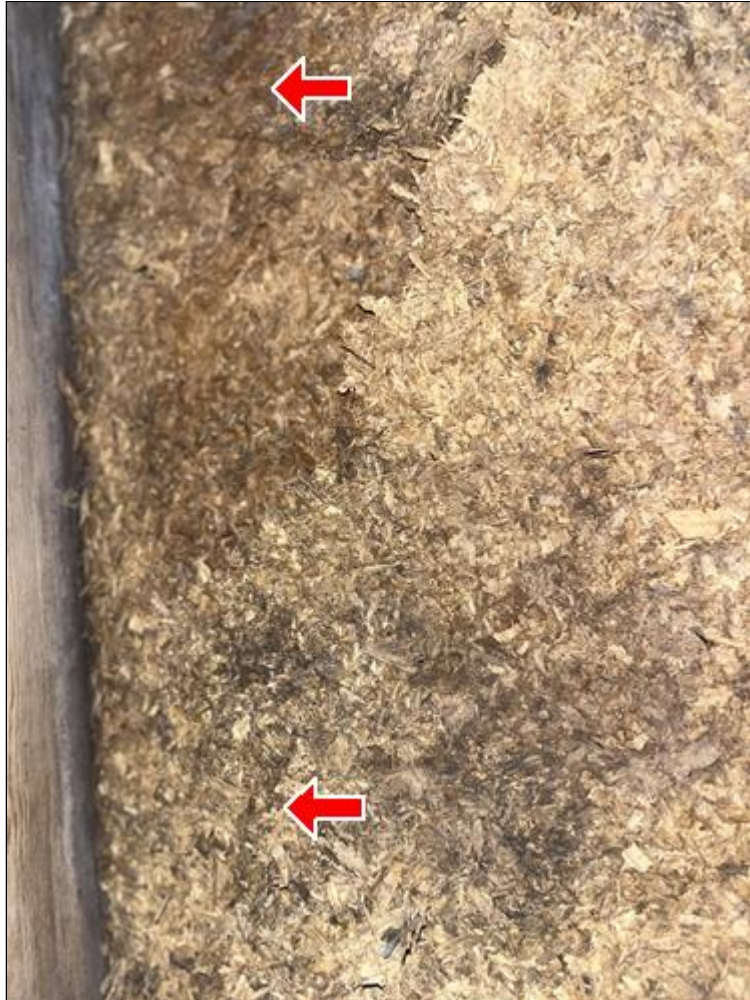
5.3 Picture 1

5.3 Sub-flooring is deteriorated from moisture absorption or water intrusion under the Guest Bedroom, Small bedroom and Hall Bath. Repairs are needed. A qualified licensed general contractor should inspect further and repair as needed. The sub-flooring underneath the Living room and Kitchen have been replaced in the past. This is for your information