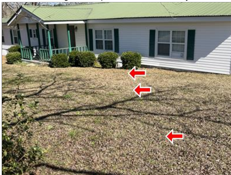
2.4 Picture 1

There is a negative slope at the front of home and can cause or contribute to water intrusion or deterioration. I recommend correcting landscape to drain water away from home.