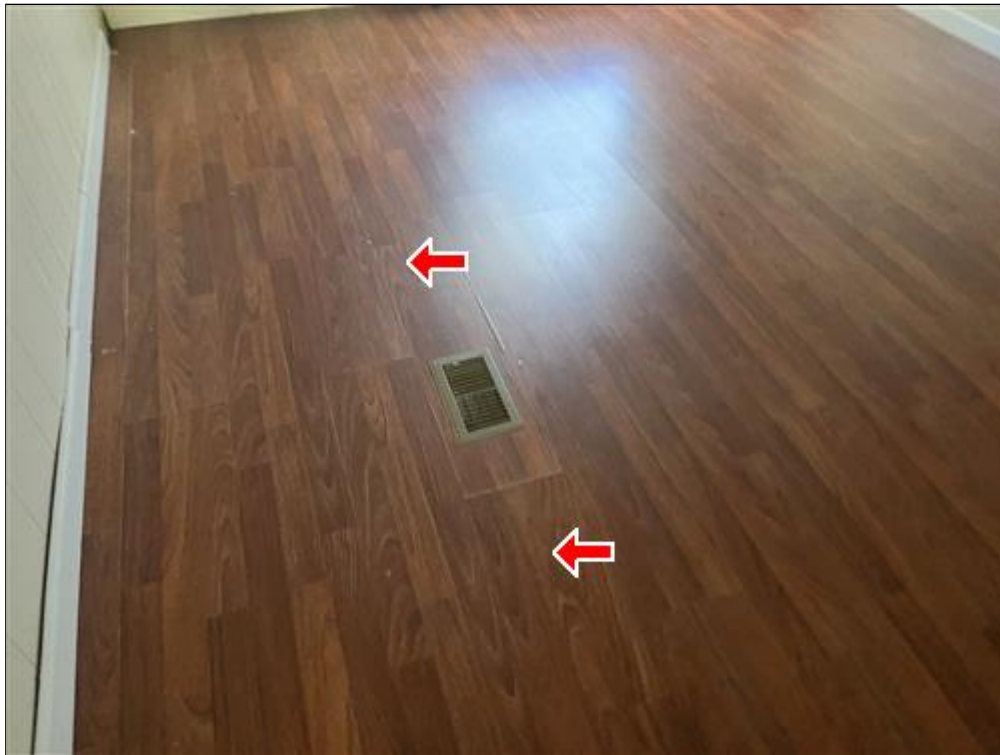
4.2 Picture 1

(1) The Sub floor is weak and not supported from underneath at the Bedroom and Guest Bedroom. While this damage is cosmetic, the repair cost should be considered due to the amount of damage. A qualified person should repair or replace as needed.