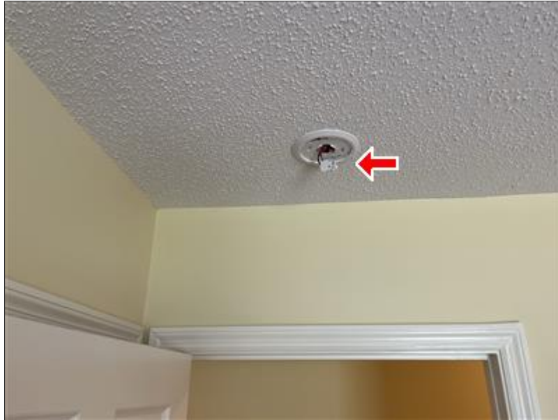
7.7 Picture 1