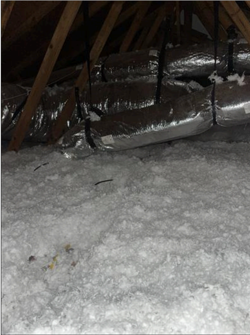
9.0 Picture 1

The insulation and ventilation of the home was inspected and reported on with the above information. While the inspector makes every effort to find all areas of concern, some areas can go unnoticed. Venting of exhaust fans or clothes dryer cannot be fully inspected and bends or obstructions can occur without being accessible or visible (behind wall and ceiling coverings). Only insulation that is visible was inspected. Please be aware that the inspector has your best interest in mind. Any repair items mentioned in this report should be considered before purchase. It is recommended that qualified contractors be used in your further inspection or repair issues as it relates to the comments in this inspection report.