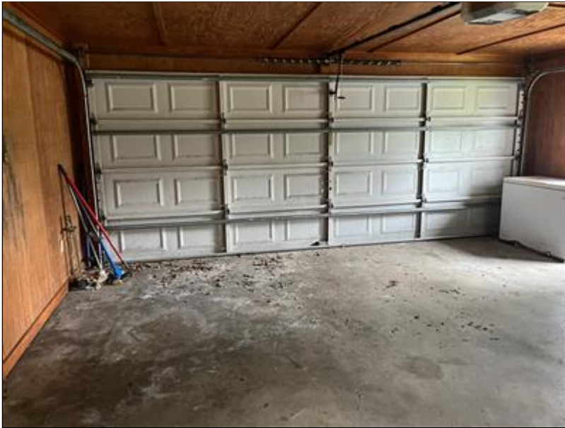
3.3 Picture 1

3.3 The garage door at the left side (facing front) does not operate properly. This is a maintenance issue and is for your information. .