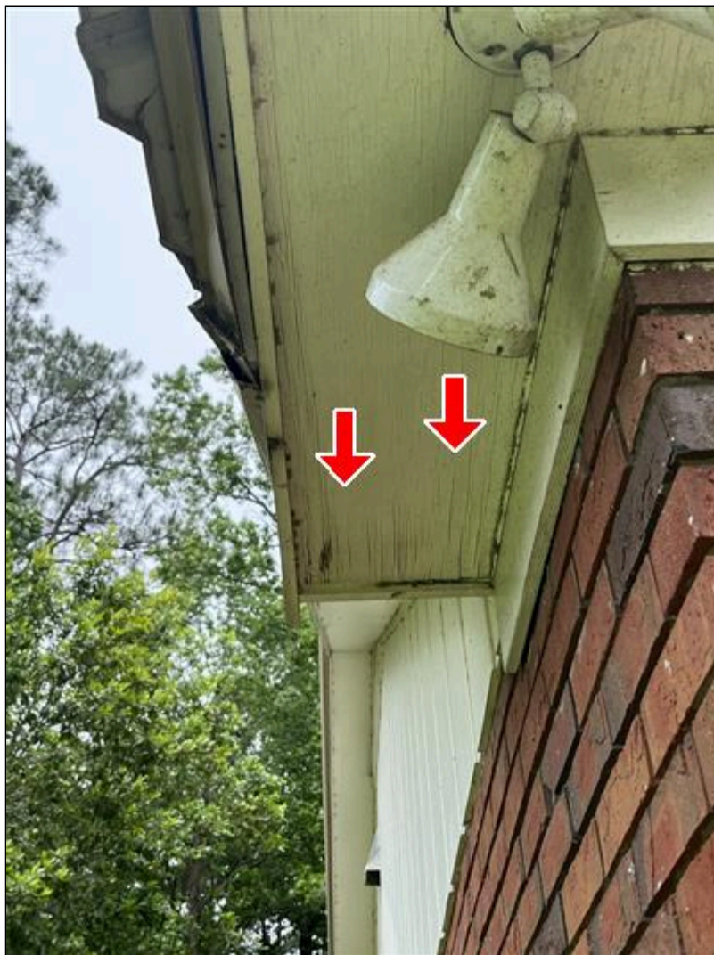
2.5 Picture 1

2.5 The soffit panel at eave on the left side (facing front) is beginning to deteriorate. Further deterioration may occur if not repaired. .