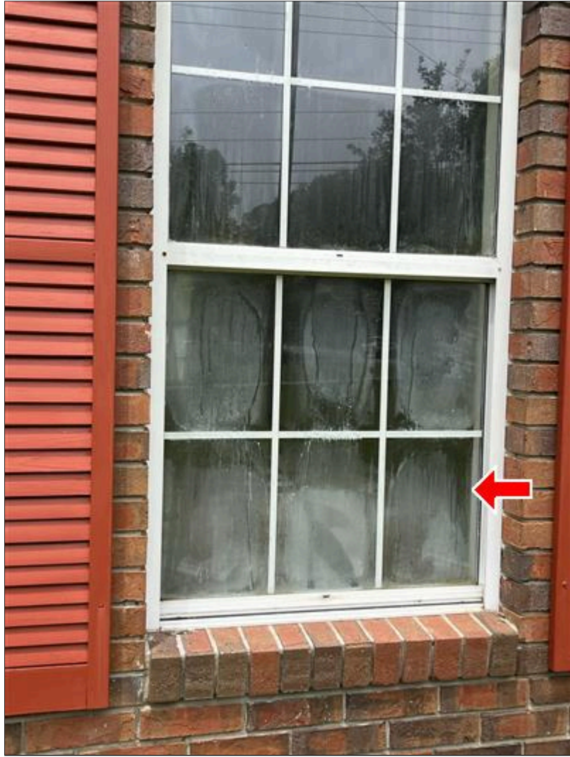
4.6 Picture 1