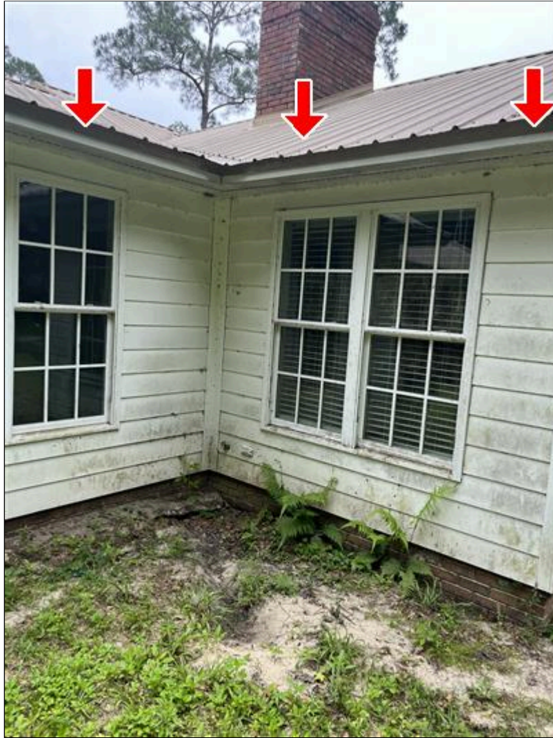
1.3 Picture 1

1.3 Gutters and drain lines are needed or erosion or water intrusion can occur at the rear of the home.