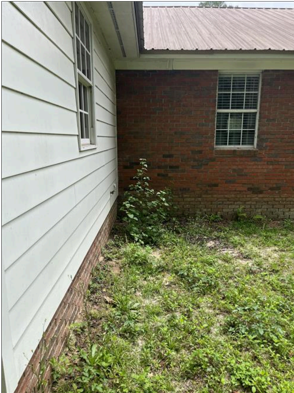
1.3 Picture 2

The roof of the home was inspected and reported on with the above information. While the inspector makes every effort to find all areas of concern, some areas can go unnoticed. Roof coverings and skylights can appear to be leak proof during inspection and weather conditions. Our inspection makes an attempt to find a leak but sometimes cannot. Please be aware that the inspector has your best interest in mind. Any repair items mentioned in this report should be considered before purchase. It is recommended that qualified contractors be used in your further inspection or repair issues as it relates to the comments in this inspection report.