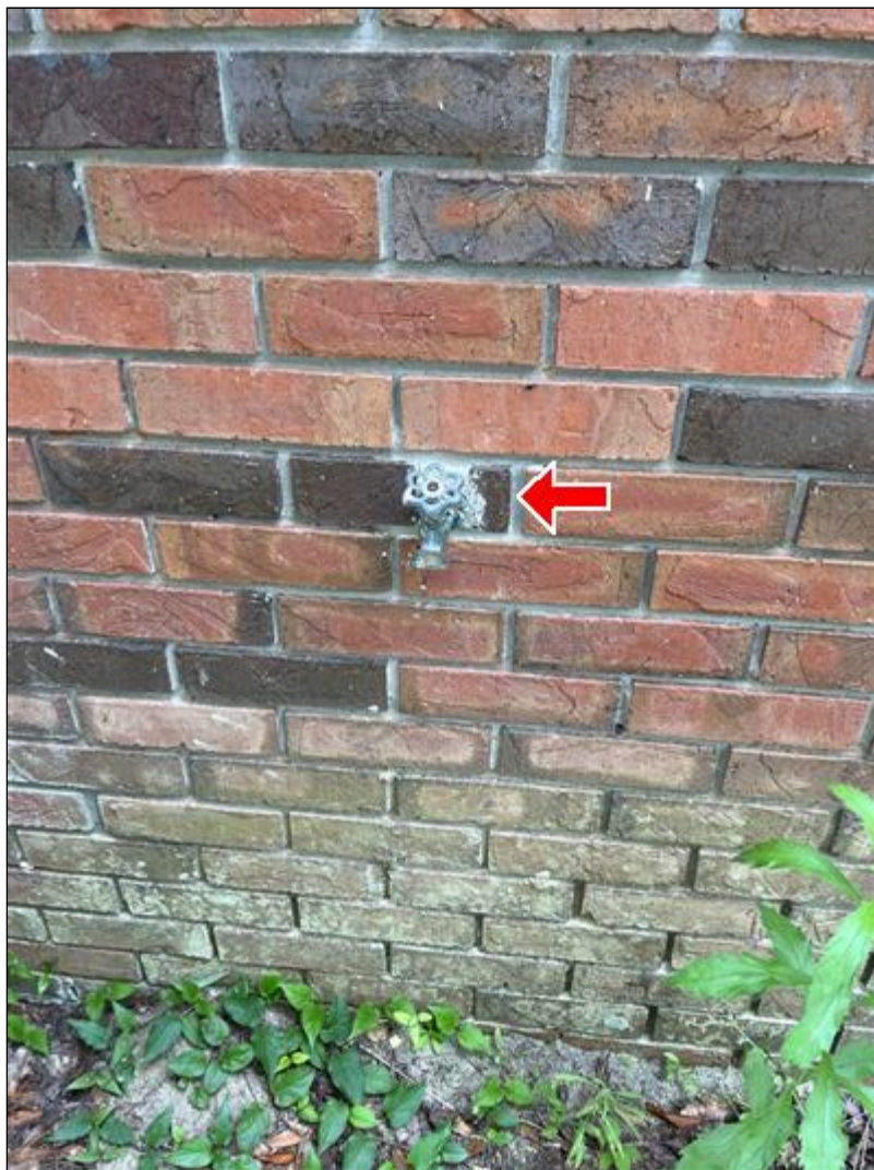
6.1 Picture 1

6.1 I could not get one of the hose bibs at the rear of the home to turn at the time of the inspection, this is for your information.