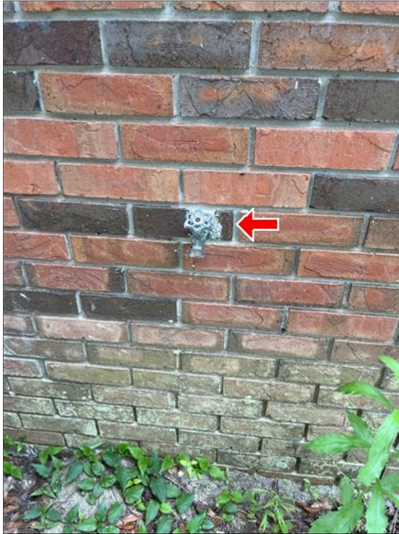
6.1 Picture 1