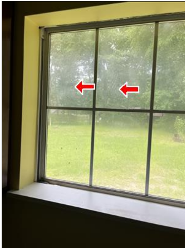
4.6 Picture 2

The interior of the home was inspected and reported on with the above information. While the inspector makes every effort to find all areas of concern, some areas can go unnoticed. The inspection did not involve moving furniture and inspecting behind furniture, area rugs or areas obstructed from view. Please be aware that the inspector has your best interest in mind. Any repair items mentioned in this report should be considered before purchase. It is recommended that qualified contractors be used in your further inspection or repair issues as it relates to the comments in this inspection report.