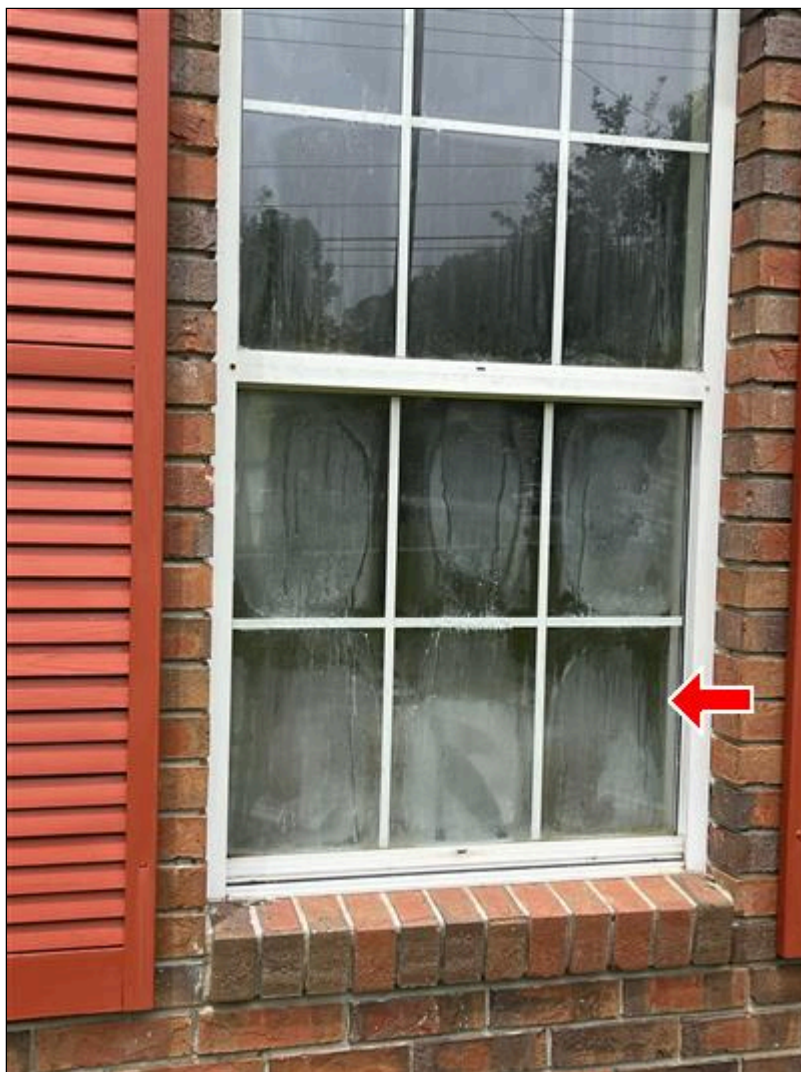
4.6 Picture 1

4.6 Two windows cloudy (lost seal) at the home. In order to correct the cloudy appearance of glass, a replacement of glass pane or the unit will be necessary. A qualified person should repair or replace as needed.