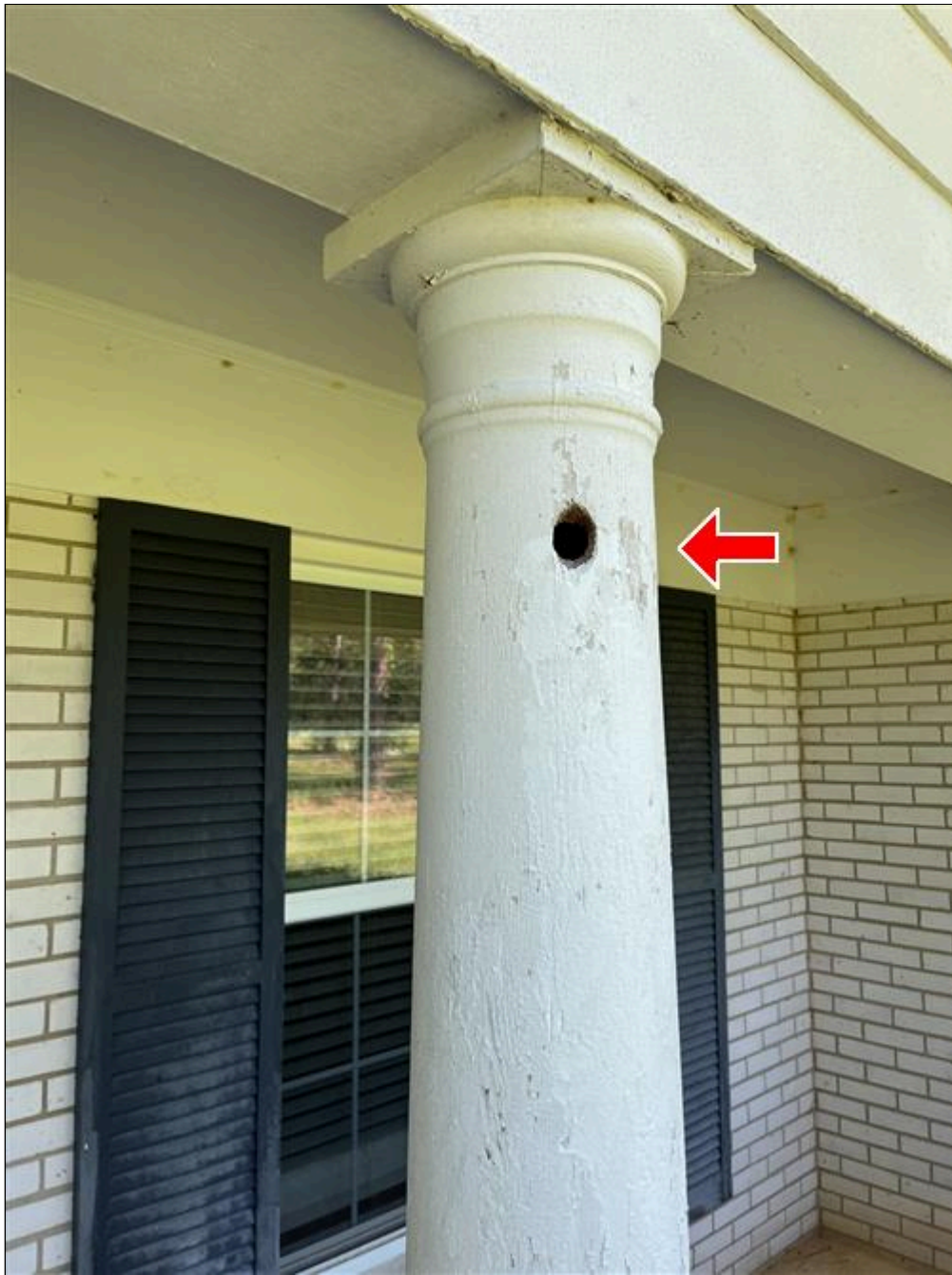
2.3 Picture 2