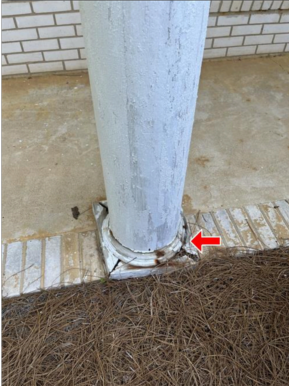
2.3 Picture 1