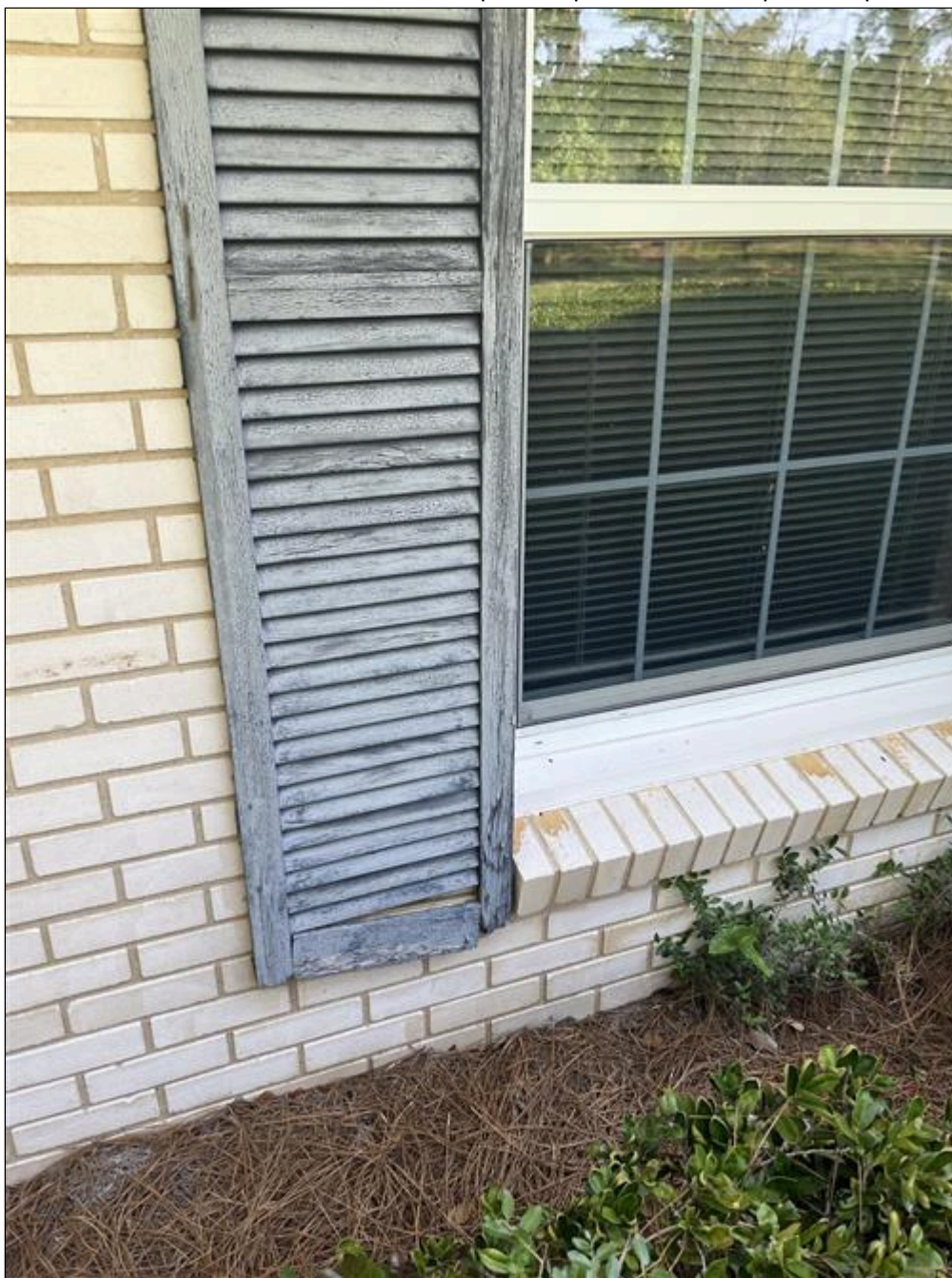
2.2 Picture 1

2.2 The wood shutters are deteriorated at front of home. . A qualified person should repair or replace as needed.