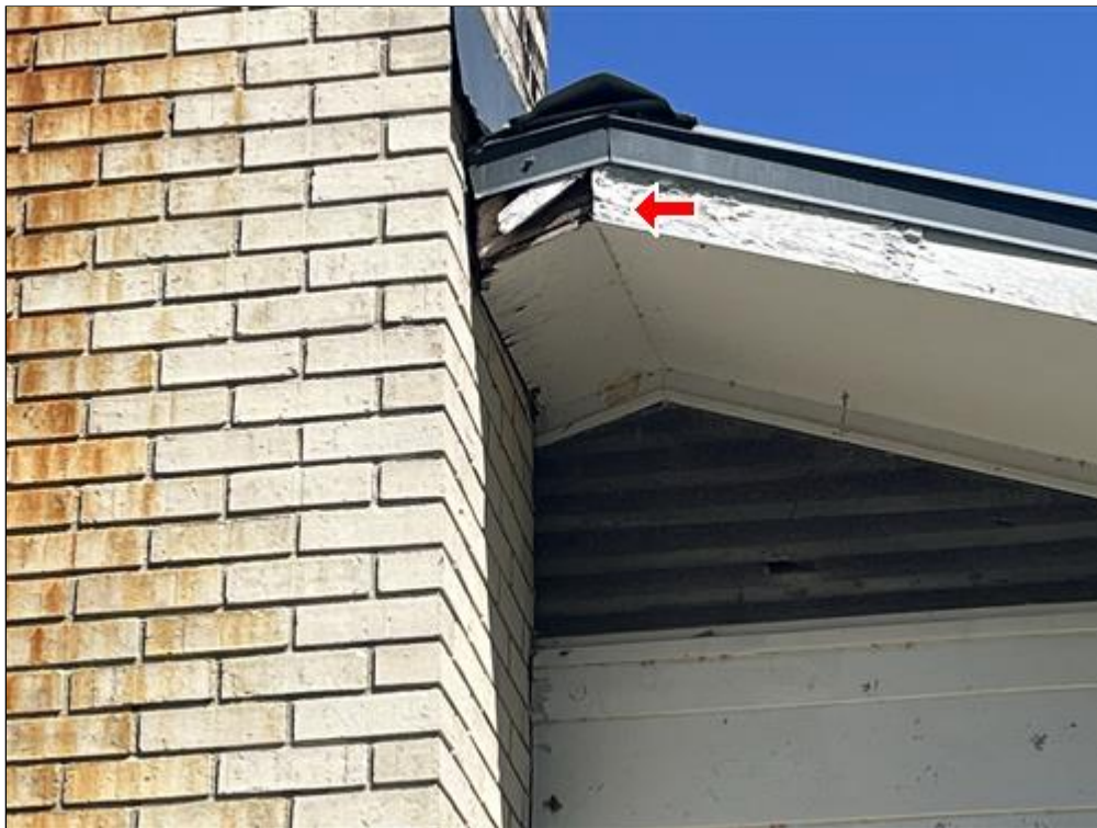
2.5 Picture 2

(2) The wood fascia at eave on the left side (facing front) is beginning to deteriorate. Further deterioration may occur if not repaired . This is a small repair. .