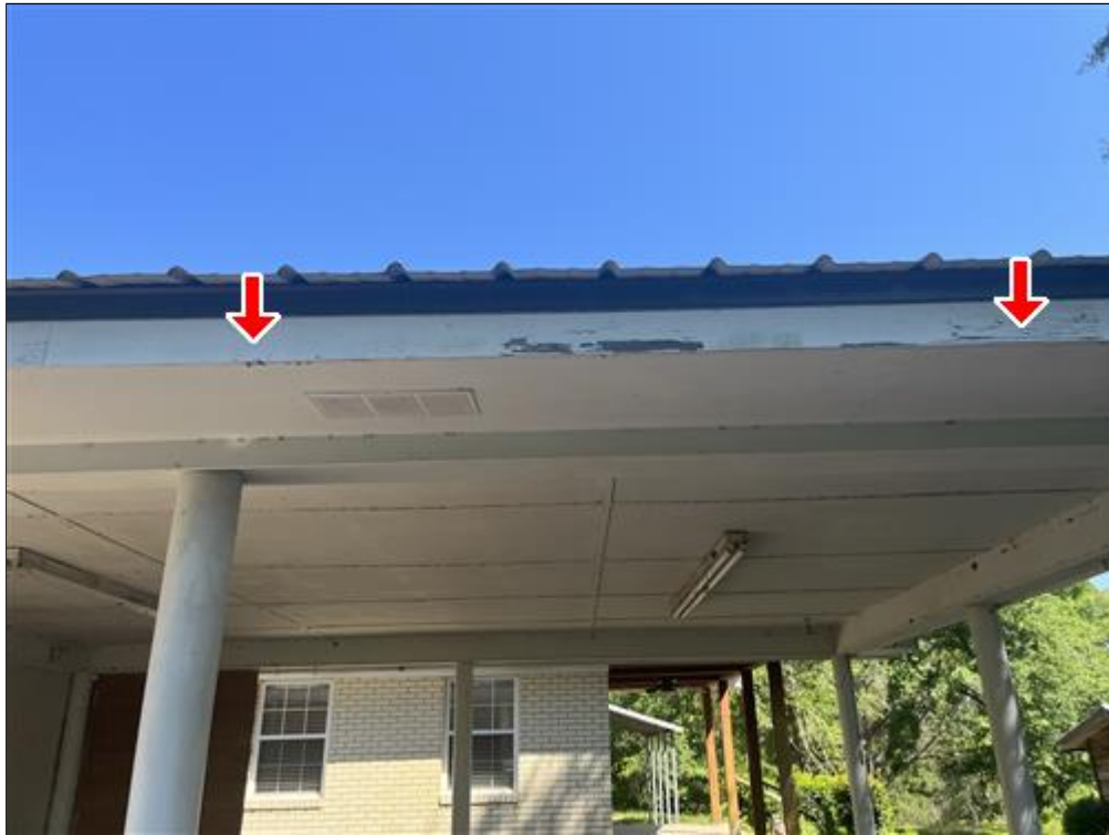
2.5 Picture 1

(2) The wood fascia at eave on the left side (facing front) is beginning to deteriorate. Further deterioration may occur if not repaired. This is a small repair. .