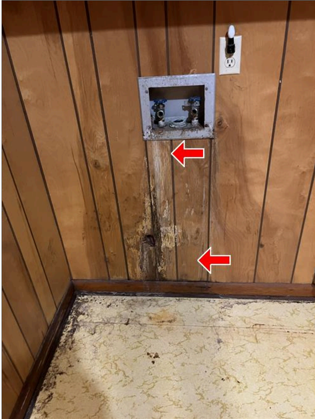
4.1 Picture 1