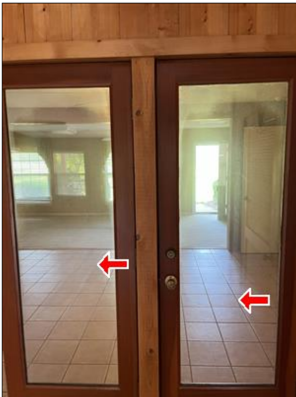
4.5 Picture 1

4.5 The French doors cloudy or seal is broken at the Sunroom. Glass panes that have lost their seal (cloudy) can usually be replaced without replacing the entire unit. A qualified person should repair or replace as needed.