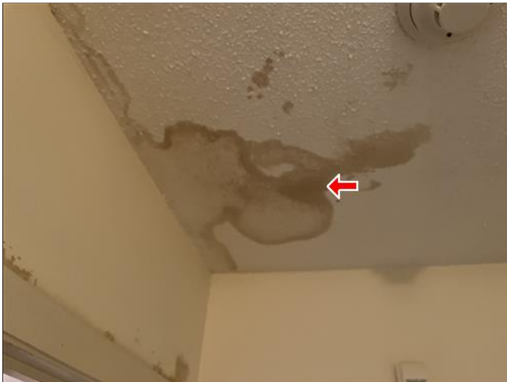
4.0 Picture 1

4.0 The Sheetrock on the ceiling reveals a water stain indicating a leak did or still exists at the Living Room. While this damage is cosmetic, it needs to be repaired. A qualified person should repair or replace as needed.