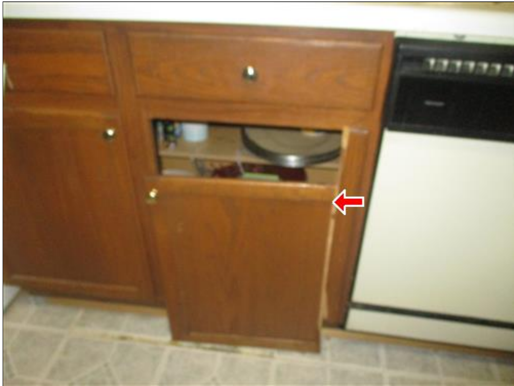
4.4 Picture 1