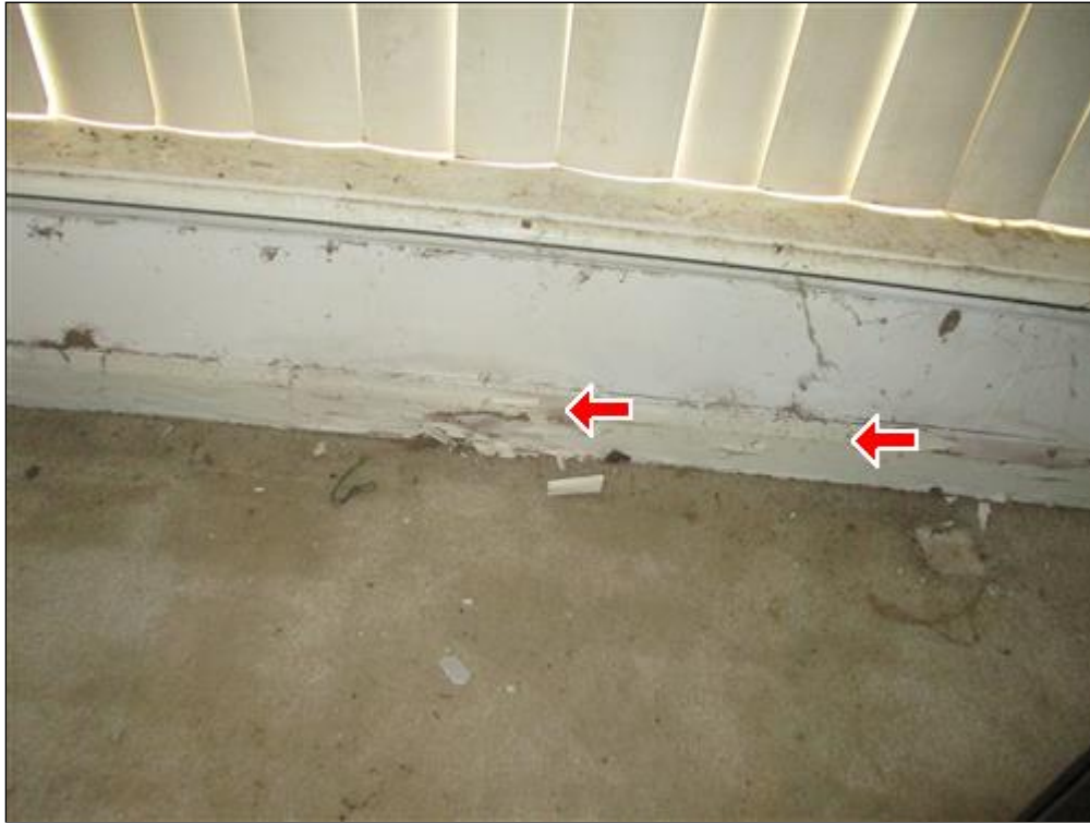
4.1 Picture 1

4.1 The sheetrock on the wall shows wet stains indicating moisture or intrusion did or still may occur at the Bedroom. This damage is considered cosmetic. .