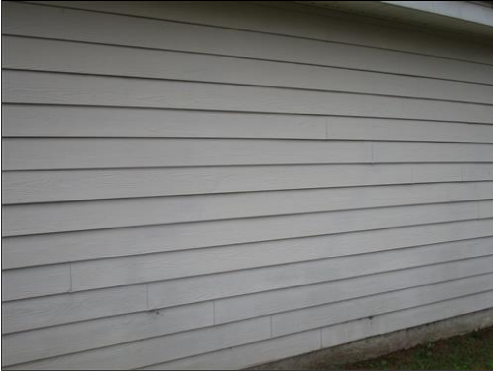
2.0 Picture 4