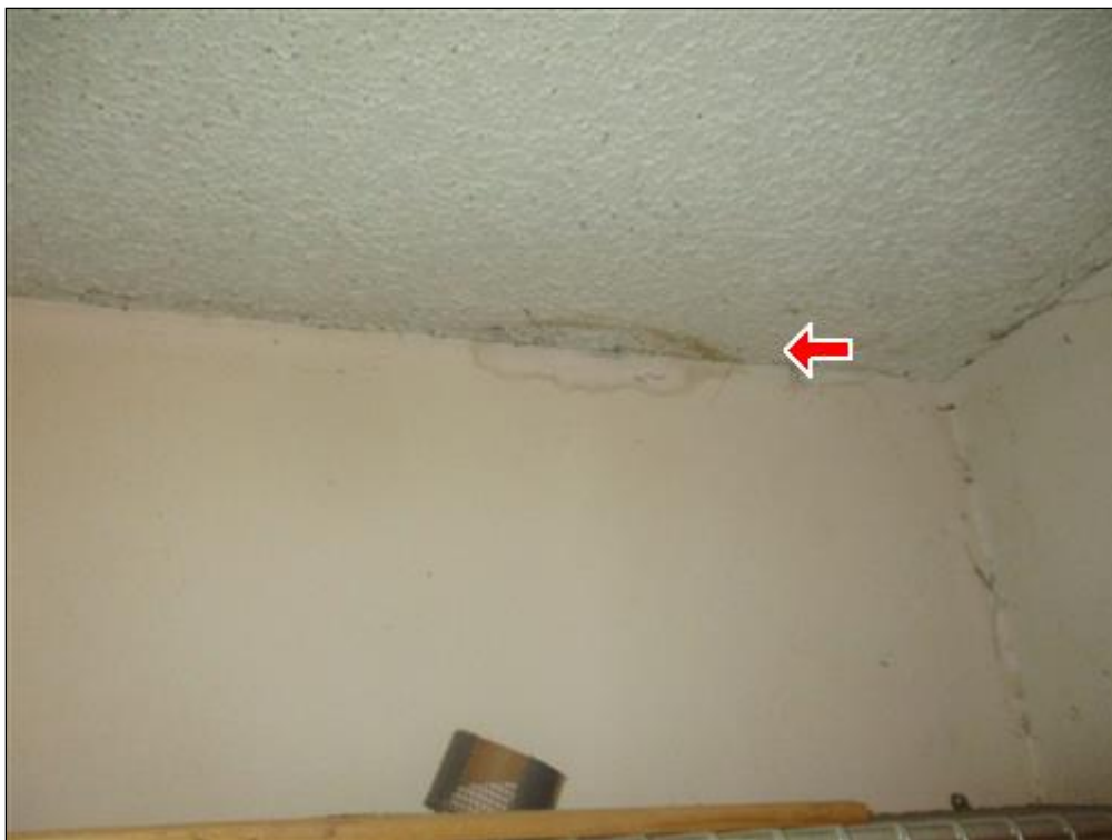
4.0 Picture 2