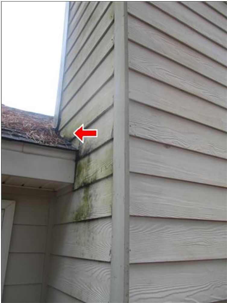
2.0 Picture 2