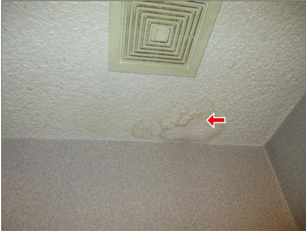
4.0 Picture 1

4.0 The Sheetrock on the ceiling reveals a light stain which appears from a water leak. Stain appears old at the hall bathroom and hallway closet. This damage is considered cosmetic. A qualified person should repair or replace as needed.