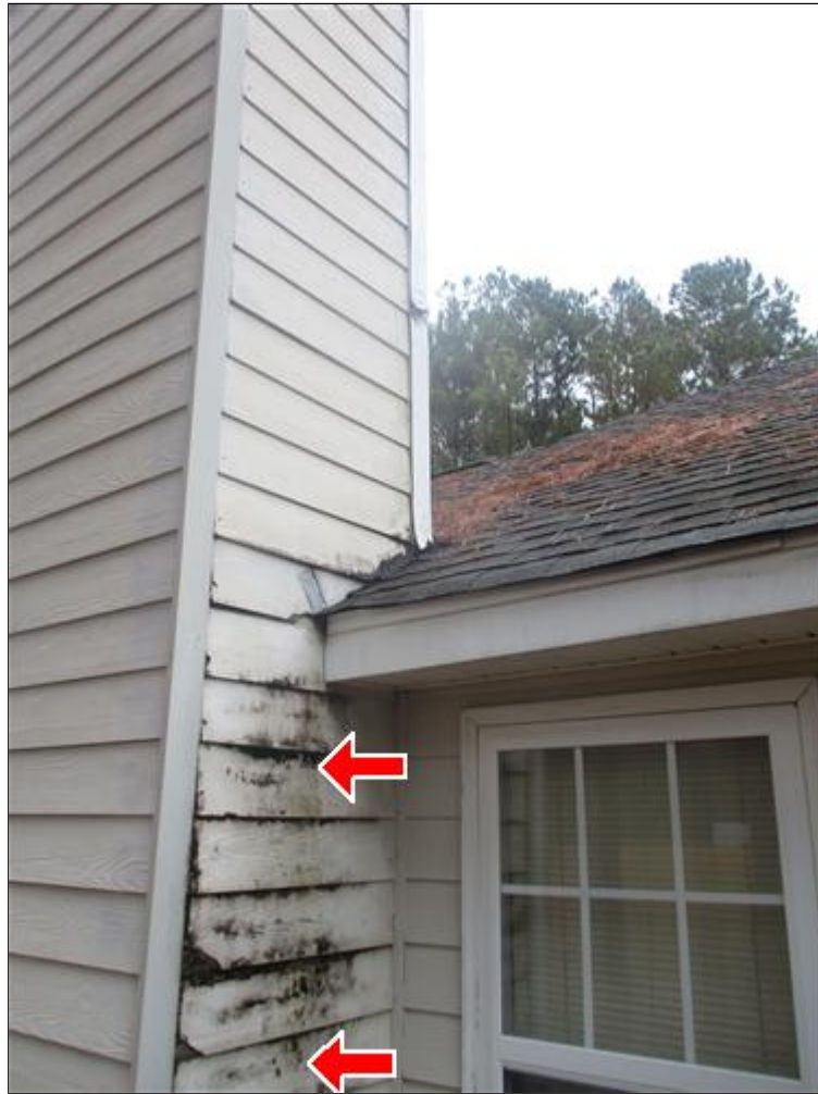
2.0 Picture 1