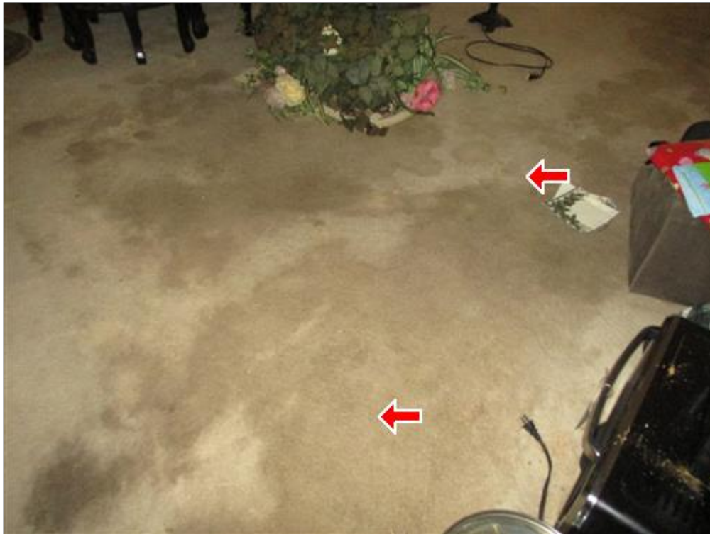
4.2 Picture 1

4.2 The Carpet is stained at the Living Room. While this damage is cosmetic, it needs to be cleaned or replaced. .