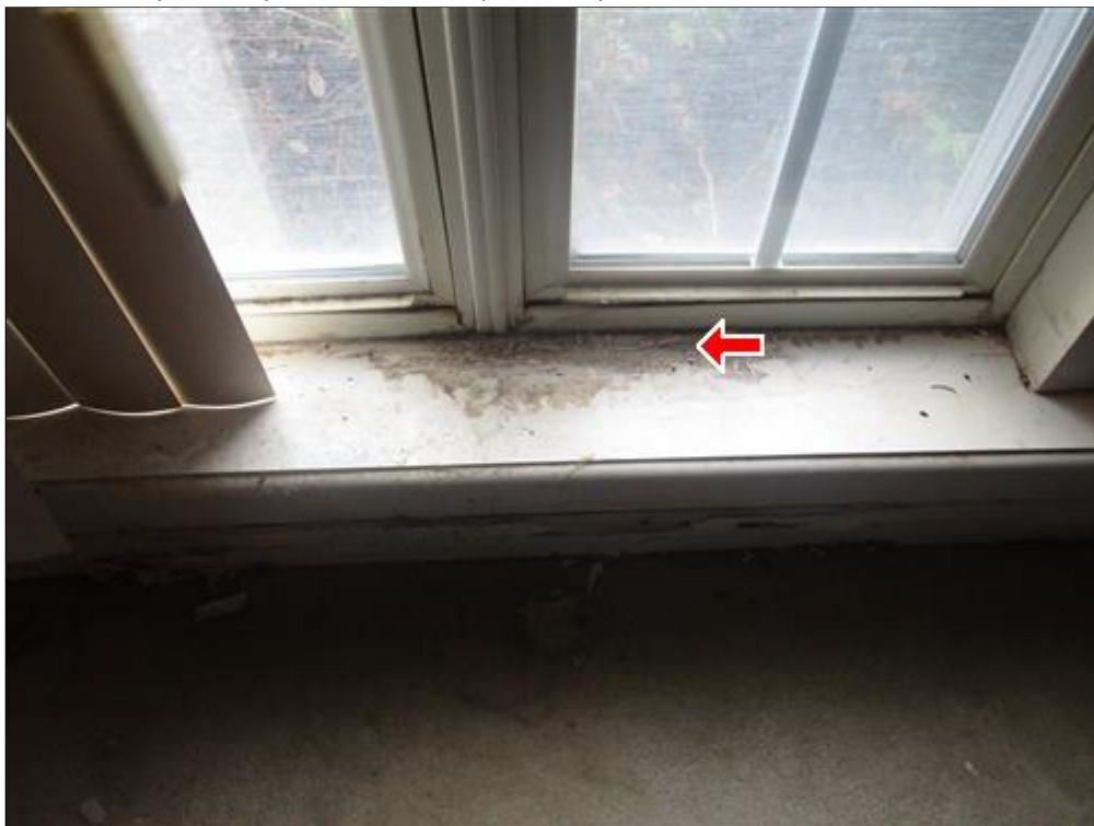
4.6 Picture 1

4.6 Two windows show wet stains where water has entered in this area at the Front Bedroom. This is a maintenance issue and is for your information. A qualified person should repair or replace as needed.