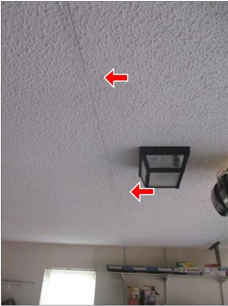
3.0 Picture 2