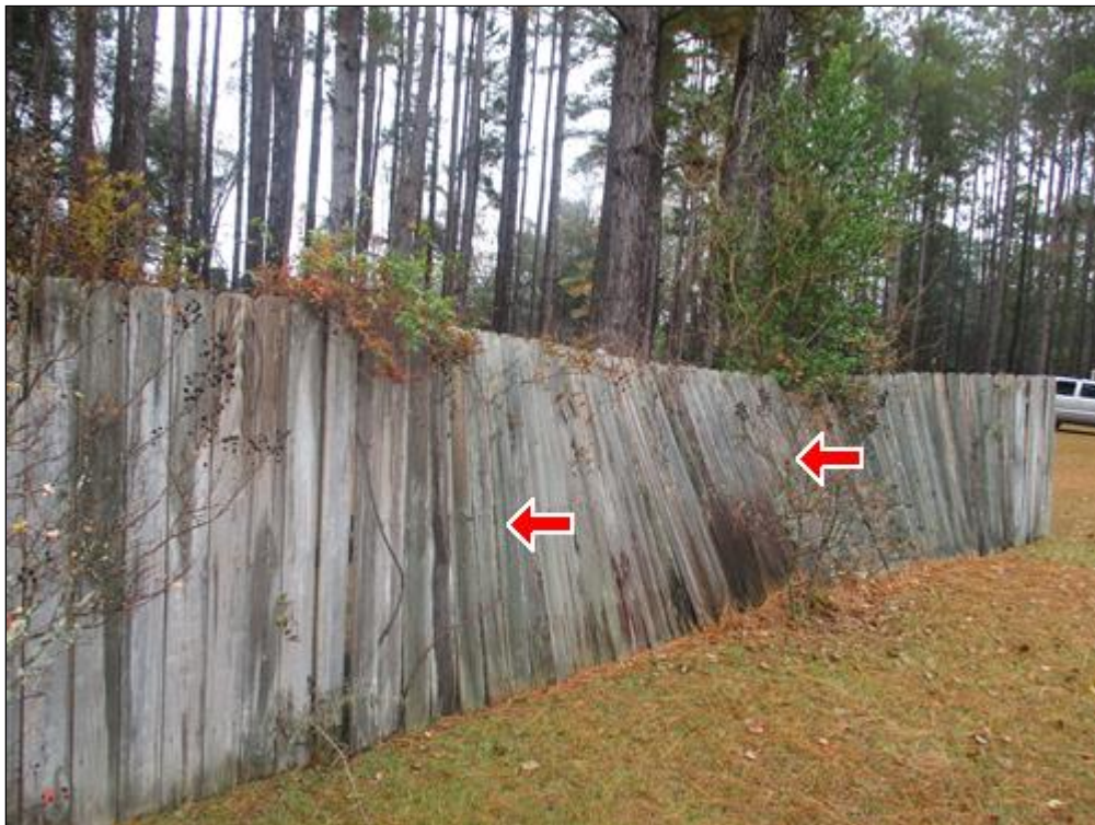
2.3 Picture 2 The wood fence is failing. A more proper support is needed.

The exterior of the home was inspected and reported on with the above information. While the inspector makes every effort to find all areas of concern, some areas can go unnoticed. Please be aware that the inspector has your best interest in mind. Any repair items mentioned in this report should be considered before purchase. It is recommended that qualified contractors be used in your further inspection or repair issues as it relates to the comments in this inspection report.