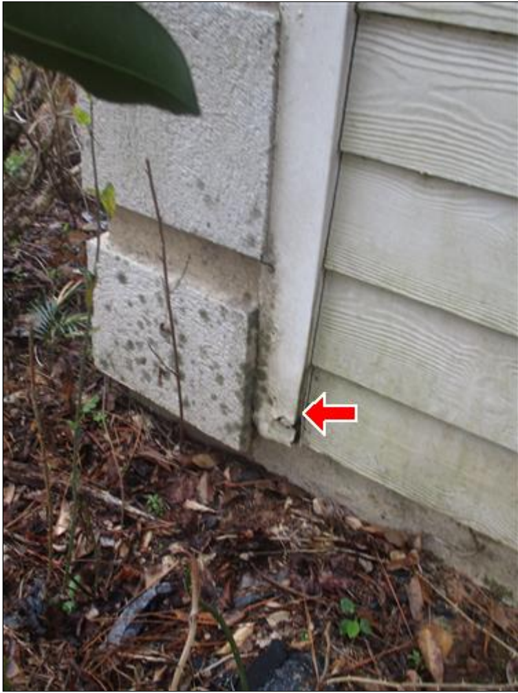
2.0 Picture 5