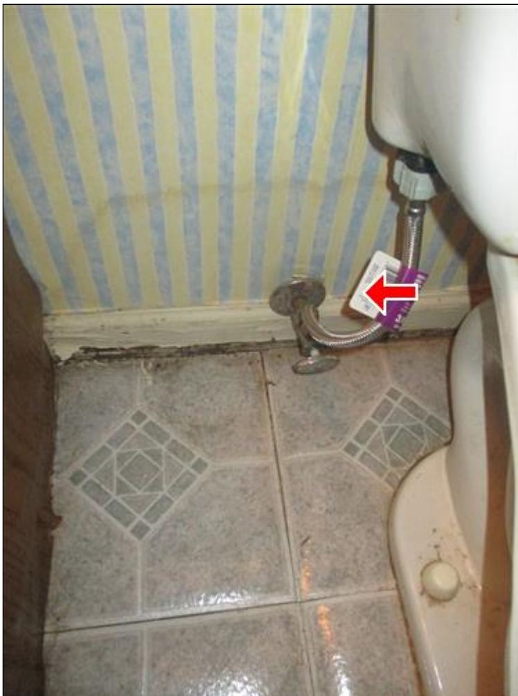
6.1 Picture 1

6.1 The toilet supply line leaked at the guest bathroom at the time of the inspection, this is a small repair and for your information.