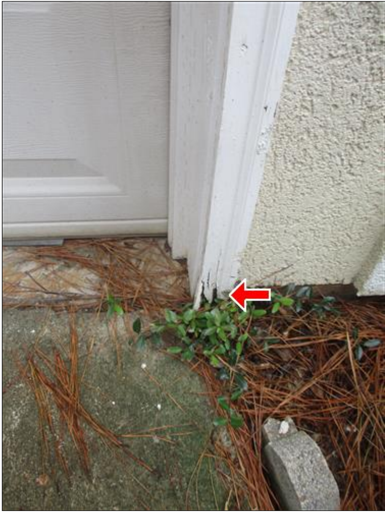
2.0 Picture 3