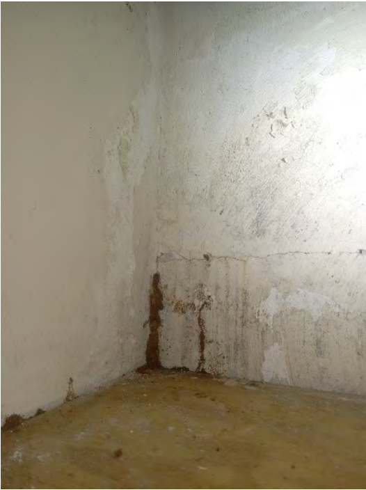
termites in shelter tube in garage