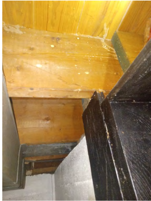
termite damage in floor joist in basement