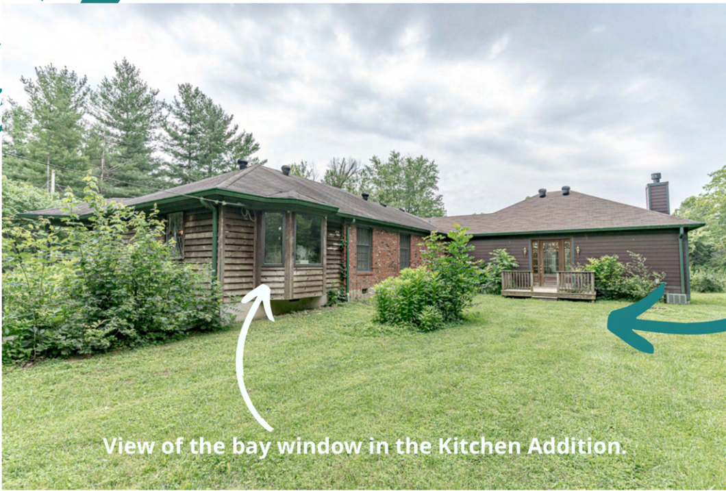
View of the bay window in the Kitchen Addition.

The back of the Great Room has a small deck attached.