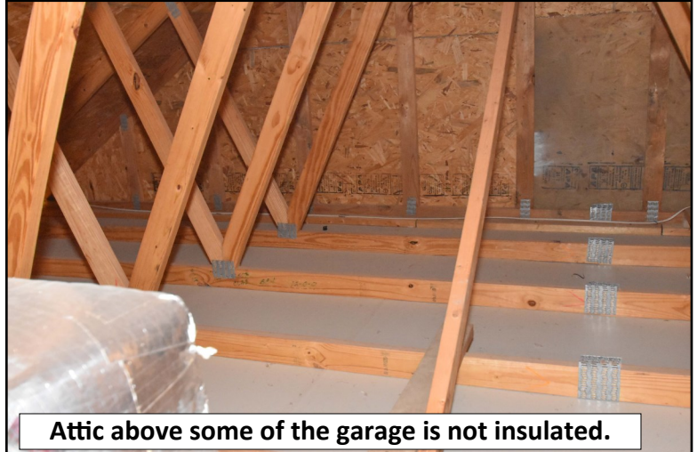
Attic above some of the garage is not insulated.