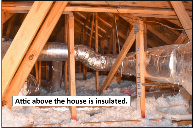
Attic above the house is insulated.