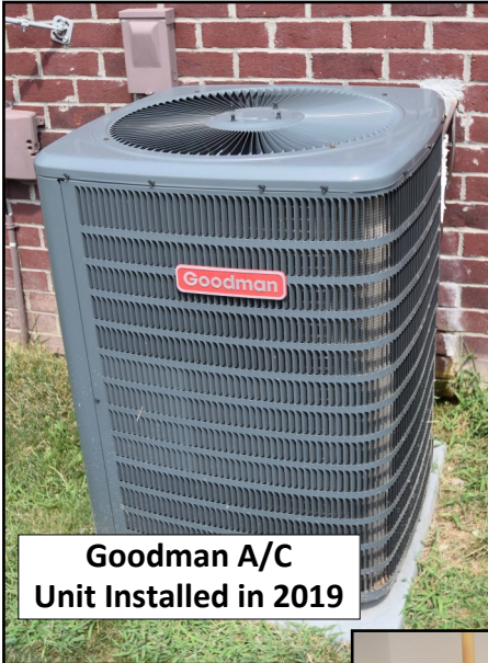
Goodman A/C Unit Installed in 2019