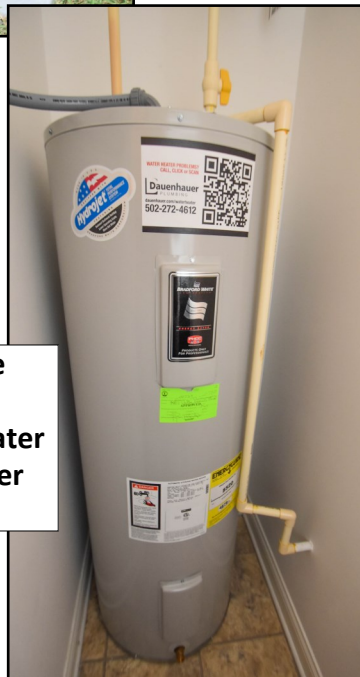
Bradford White 50 Gallon Electric Water Heater Inspection Sticker 1-24-13