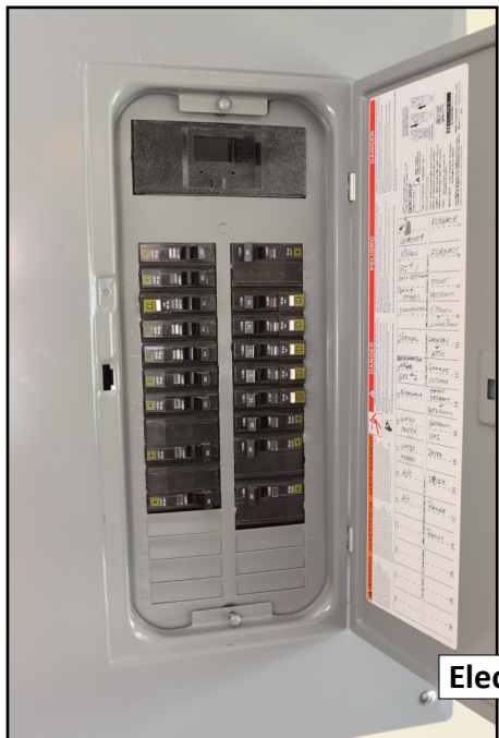
Electric Panel Box is in the Garage