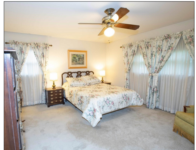
Master/Primary Bedroom approx. 13'5" x 15', with an en suite bathroom and a walk-in closet (approximately 4'9" x 3'9"). A single side and double rear windows, carpeted.