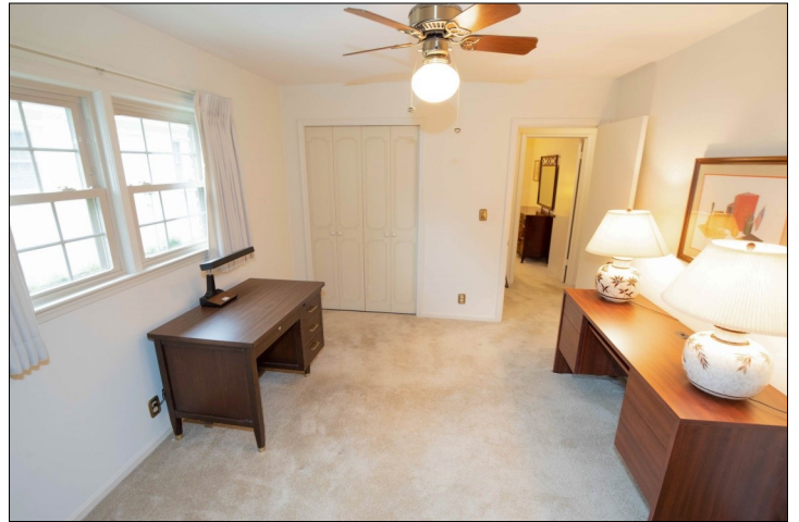
Rear Guest Bedroom approx. 13'6" x 10'6", plus the double closet, double side windows, carpeted.