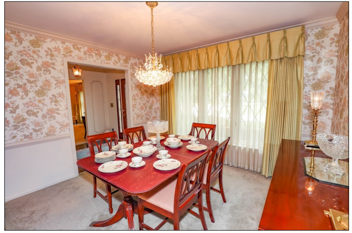
Dining Room approx. 11'9" x 11'5", chair rail, crown molding, and a beautiful crystal chandelier. Triple front windows. Pocket door into the kitchen. Double open doorway with fluted casing leading into the front foyer. Carpeted. Approximately a year ago, the front wall and window area was treated by Orkin Pest Control for carpenter ants. There is some damage, but there has been no further infestation observed.