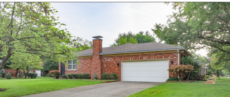
The two car garage is finished.