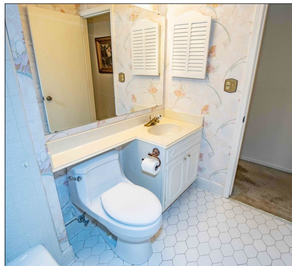
Full Bathroom off of the main hallway approx. 7'10" x 5'7", white vanity with a white cultured marble top and sink, 4'6" wide mirror over the sink. Ceramic tile floor and tub enclosure.