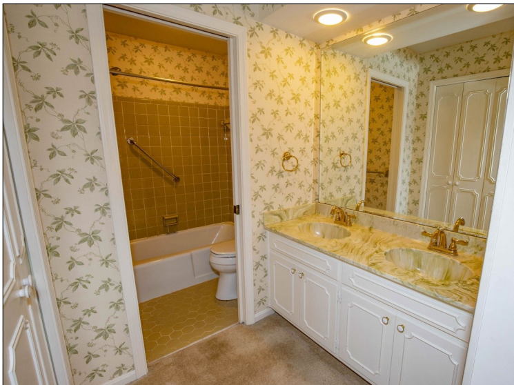
En suite Master/Primary Bathroom approx. 5'9" x 4'8" dressing area and a 5' x 4'10" bath area. The dressing area is carpeted and features a double closet, a double vanity with cultured marble sinks, a 4'5" wide mirror over the sinks, and recessed lighting. The bath area has ceramic tile flooring and tub enclosure. A pocket door separates the two bathroom areas.

All room measurements shown are approximate and may have been rounded.