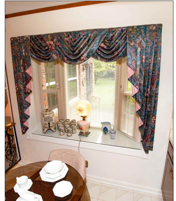
A 5'7" bay window overlooking the rear patio.