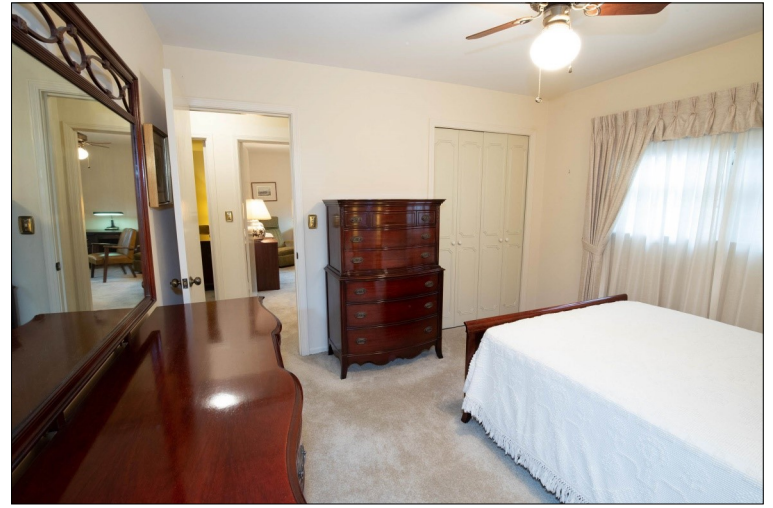
Middle Guest Bedroom approx. 11'8" x 11', plus the double closet, double side windows, carpeted.