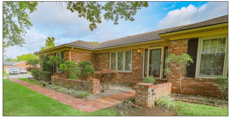
Home has two brick walkways and a front courtyard.