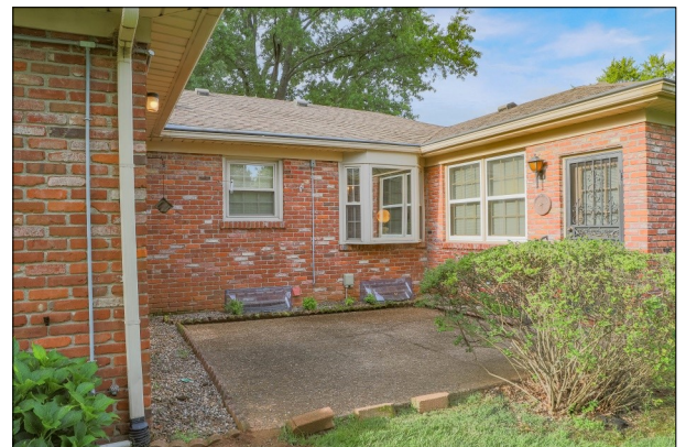
Rear Patio is approx. 13'6" x 12'5".