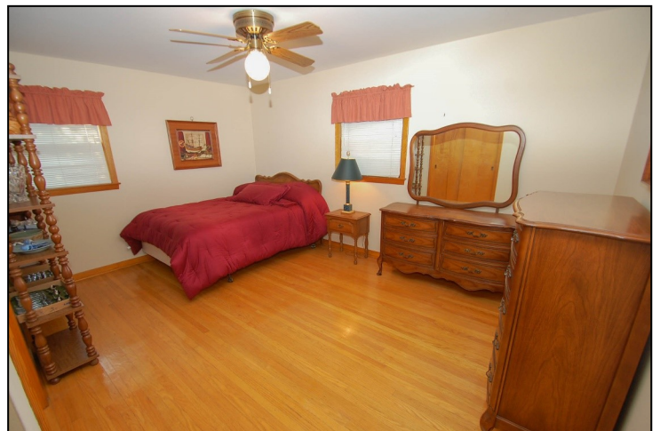
Rear Bedroom approx. 15'6" x 11' plus the double closet, oak hardwood flooring, natural finished woodwork, single rear and side windows.

All room measurements shown are approximate and may have been rounded.