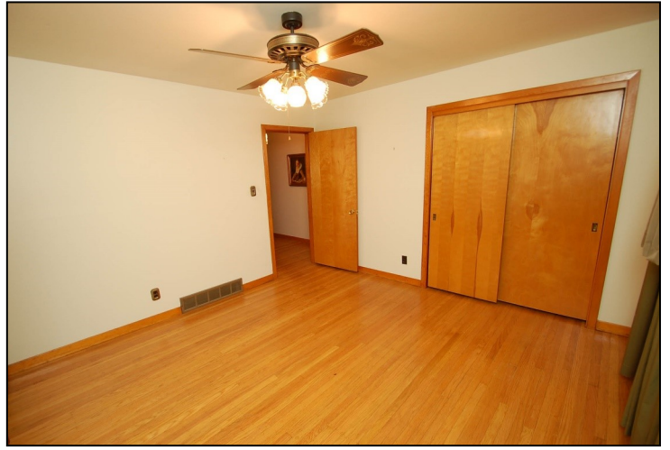
Front Corner Bedroom approx. 12'11" x 12'4" plus the double closet, oak hardwood flooring, natural finished woodwork, double front windows, single side window. Note: Floor does have 3 small cigarette burns.