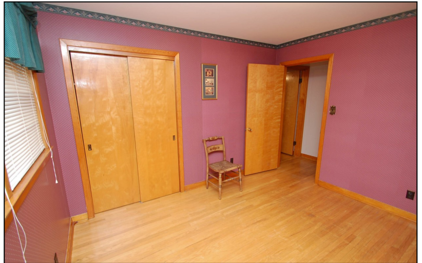
Middle Bedroom approx. 11'8" x 10'1" plus the double closet, oak hardwood flooring, natural finished woodwork, double side windows.