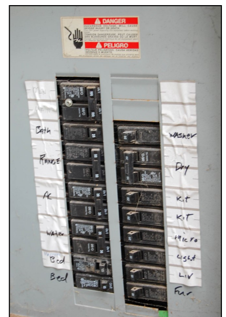
The electrical breaker box is located outside, inspection sticker is dated 8/30/06.