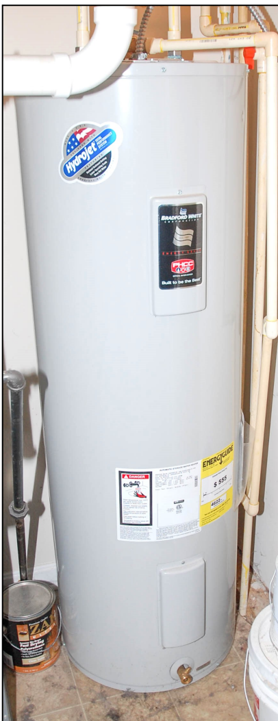
40 gallon, electric Bradford White water heater.

NOTE: When purchased from a bank in 2016, the furnace, air conditioning unit, water heater, kitchen appliances, and carpet were missing from this property. According to the buyer/current owner, he completely updated the home in 2016 including cleaning, painting, new appliances in the kitchen, new furnace & central air, new water heater, and all new flooring including the bathrooms and wood flooring in the rest of the home.