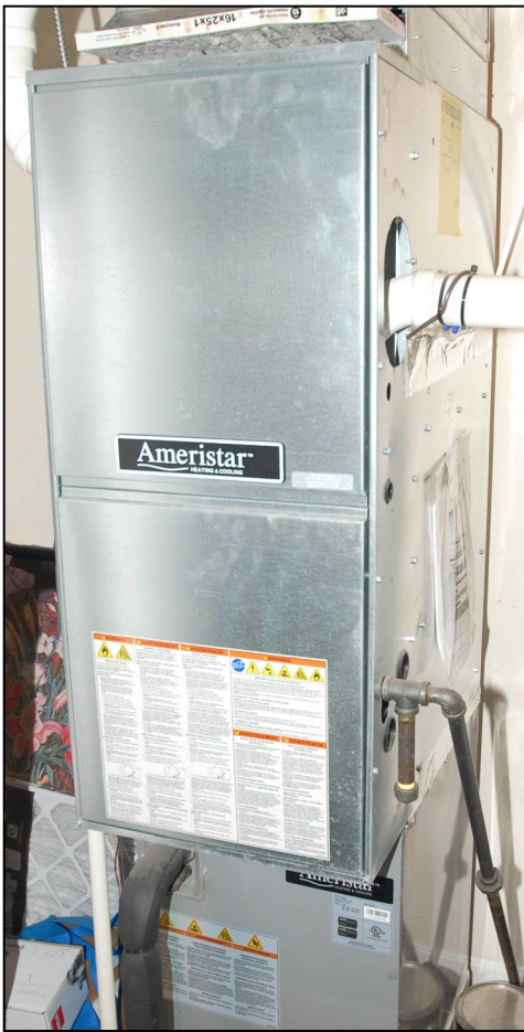
Ameristar gas furnace and central air unit.