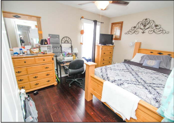
Large Rear Bedroom, irregular shaped, approx. 13'11" x 10'2" & 8'11" plus the double closet, with a single rear window and wood flooring.