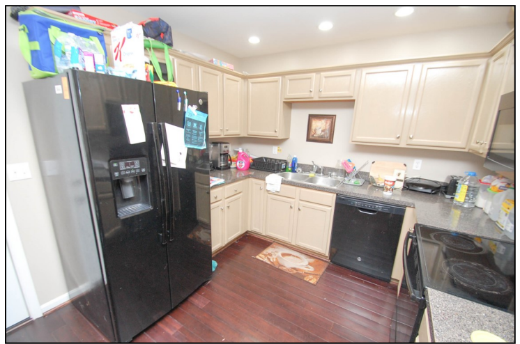
Large Eat-In Kitchen approx. 16'4" x 9'10". Wood flooring, oak cabinets, recessed lighting, and rear door, with security door, leading out to the deck. The GE refrigerator, GE electric range, and the built-in GE dishwasher remain with the home and according to the current owner, were new and a part of the updating in 2016.