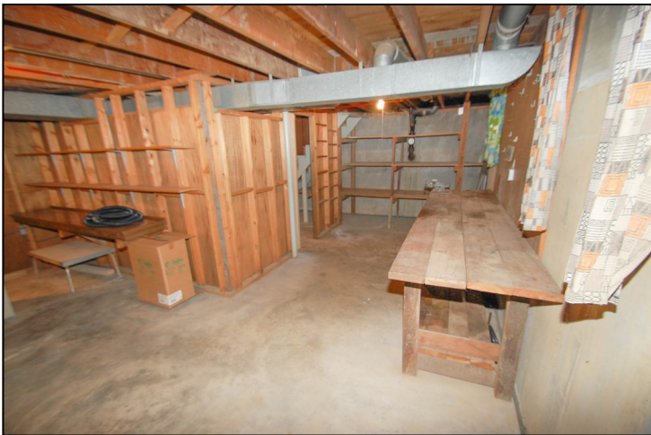
The unfinished area of the basement has built-in wood shelving and a 10' wood workbench with a 3" Wilton vise that will remain with the house.