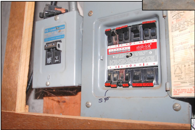
Electrical breaker box is located in the basement and may be original to the house.