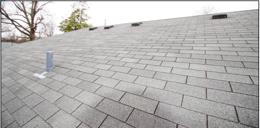
A new roof was installed on the house by Merrill Construction on October 30, 2009.