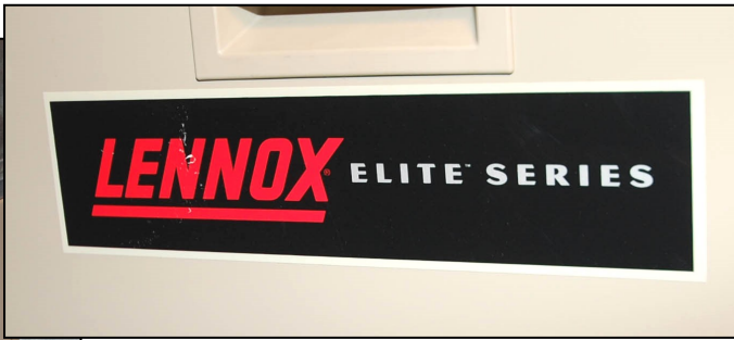
Lennox gas furnace and central air were installed by Prudential Heating and Air Conditioning Co. in 1996.