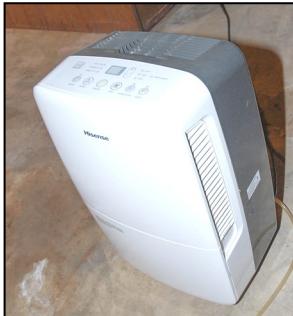
The Hisense dehumidifier remains with the house.