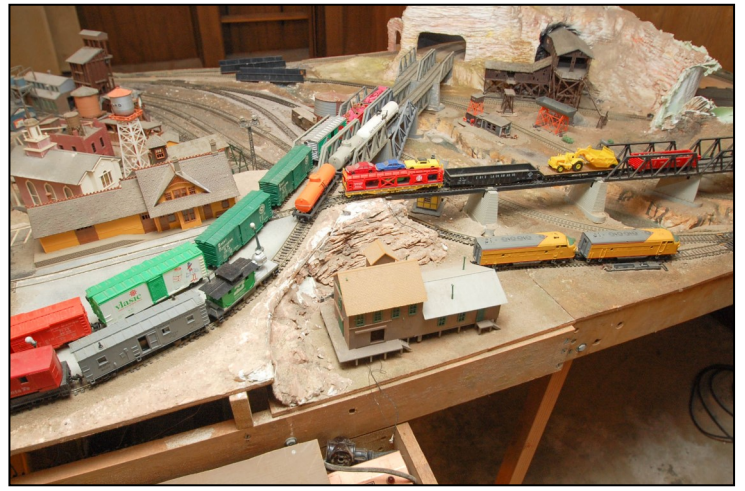
The large older train board, the HO gauge trains, and related accessories will remain with the house.