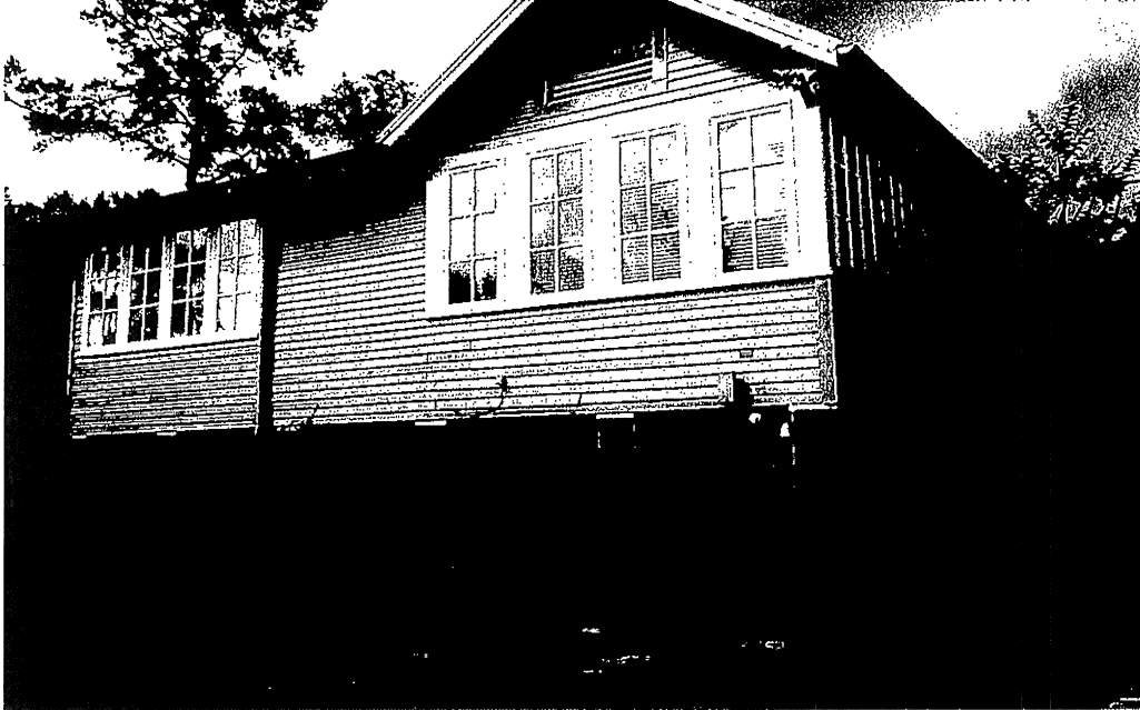
SIDE VIEW 6/6/14