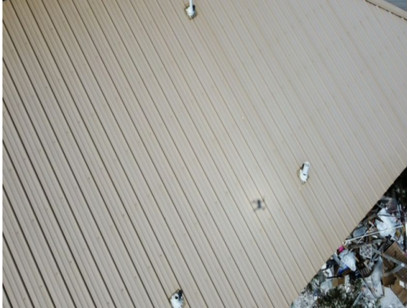
Metal Roof Covering