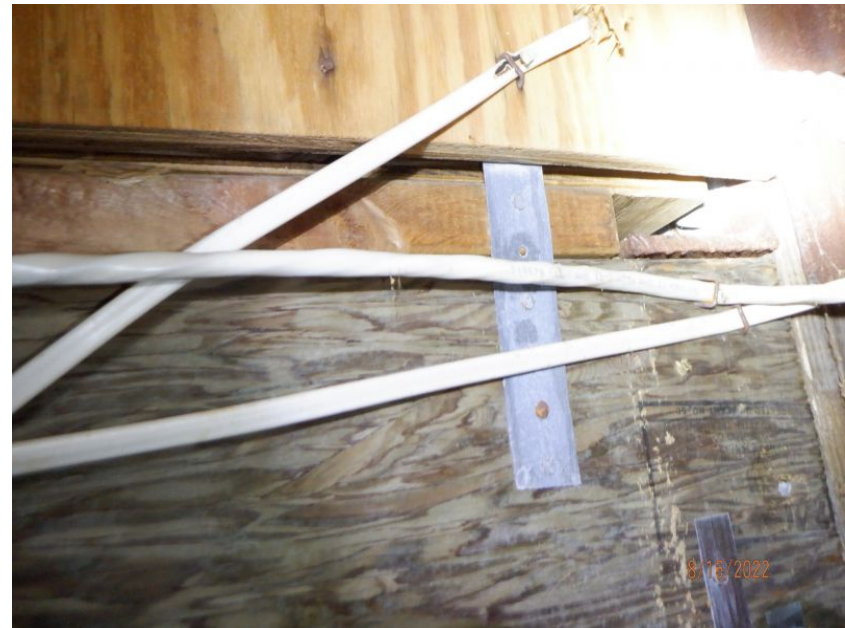
Opposing side of Truss