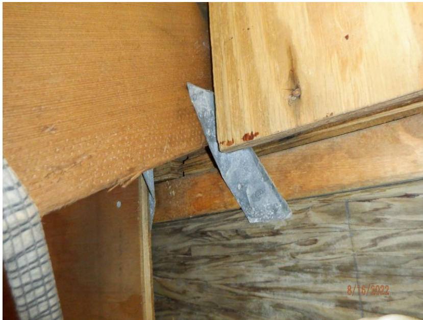
Clip with 3 Nails