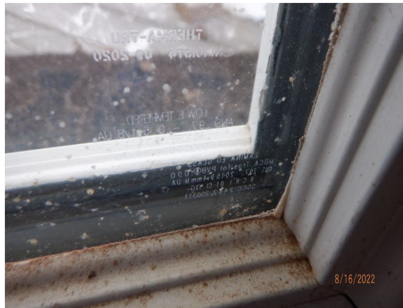
Impact Rated Glazed Door Etching/Engraving