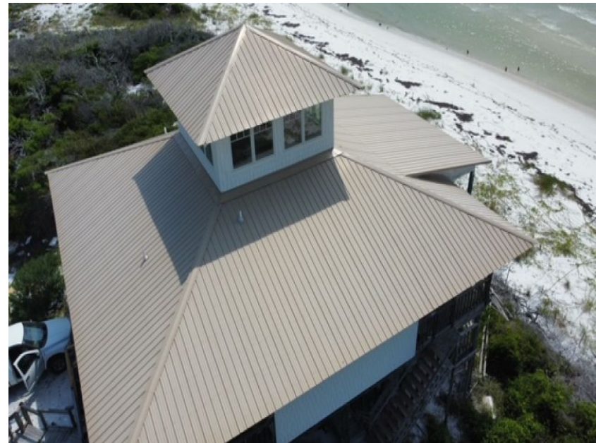
Metal Roof Covering