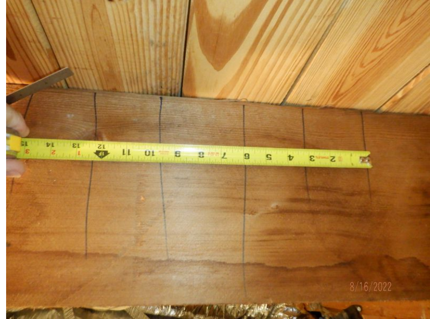
Dimensional Lumber/Tongue & Groove-2 nails per board