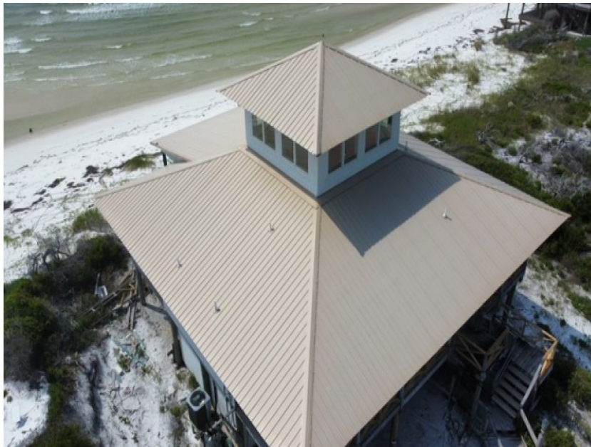
Metal Roof Covering