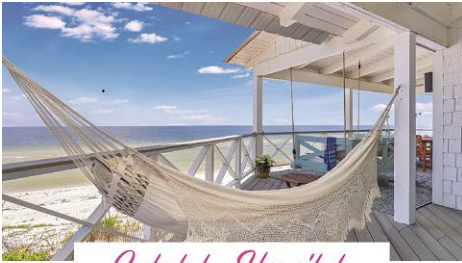
Secluded - Unspoiled