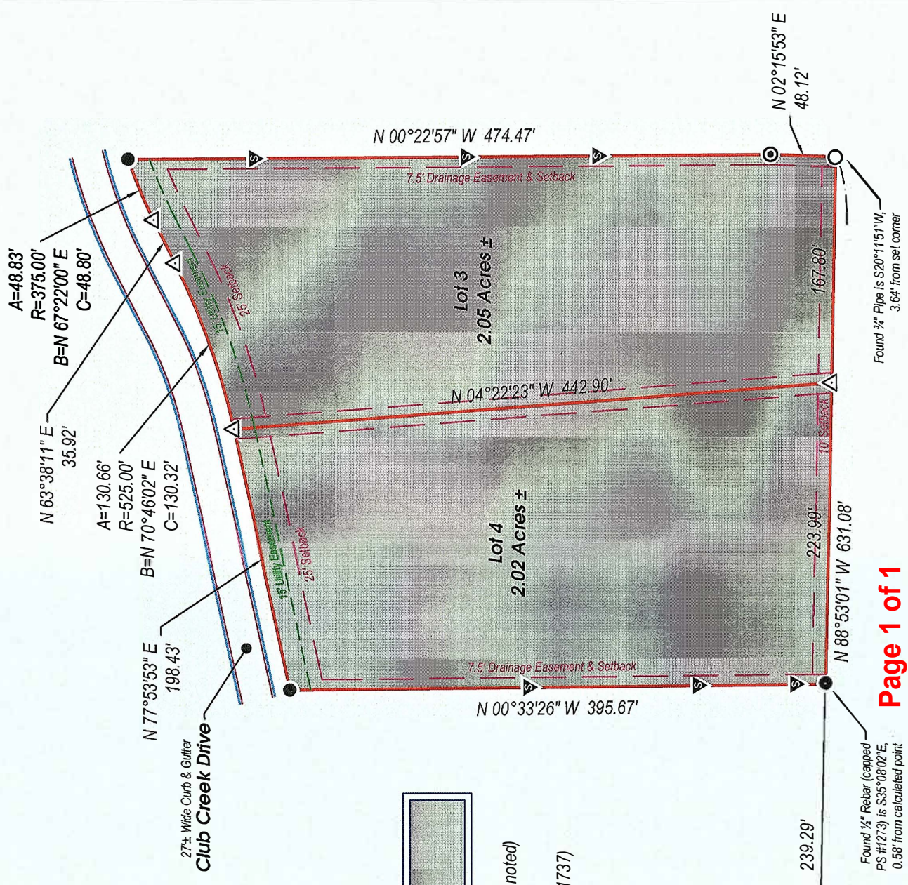
EXHIBIT B Boundary Survey