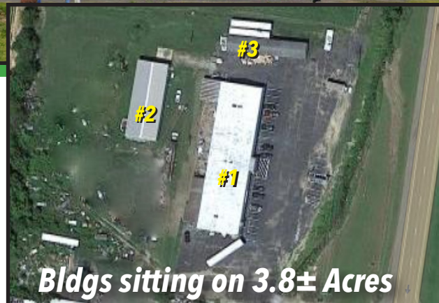
Bldgs sitting on 3.8± Acres