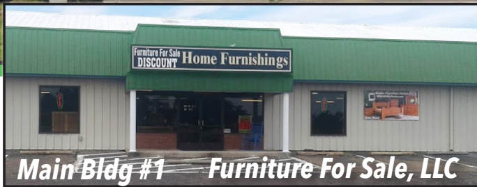
Main Bldg #1 Furniture For Sale, LLC