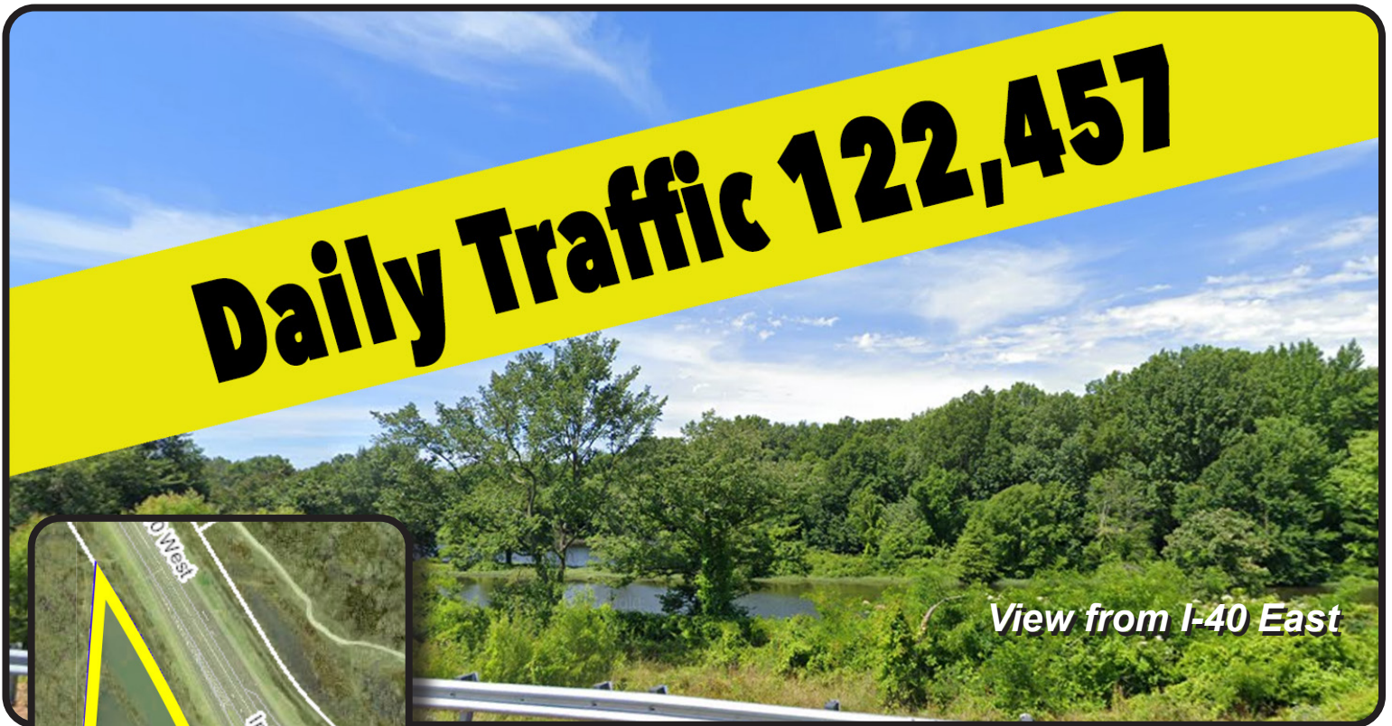
View from I-40 East