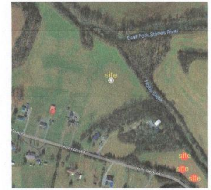
Vicinity Map n.l.s.

Gary Mace Property 487 & 401 Hollis Creek Road tracts 2 & 4 tax map 45 parcel 32.00 & 34.00 Cannon Co., TN