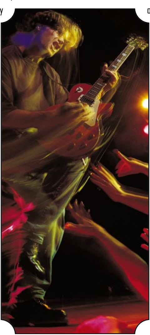
The new TR Series speakers are made for the way you play.

So just by looking at the price, you may not believe that the TR Series is actually a JBL. But take a listen. It's loud. It's clear. It's consistent. It's JBL.