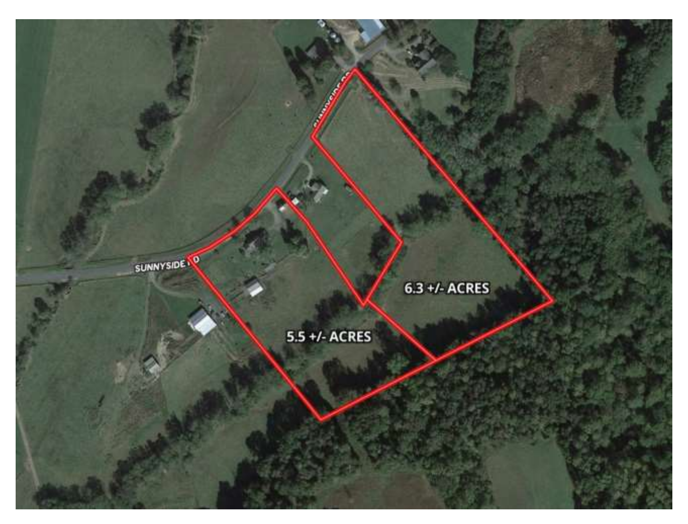
27600 Sunnyside Rd., Unionville, VA 22567 (Orange County)