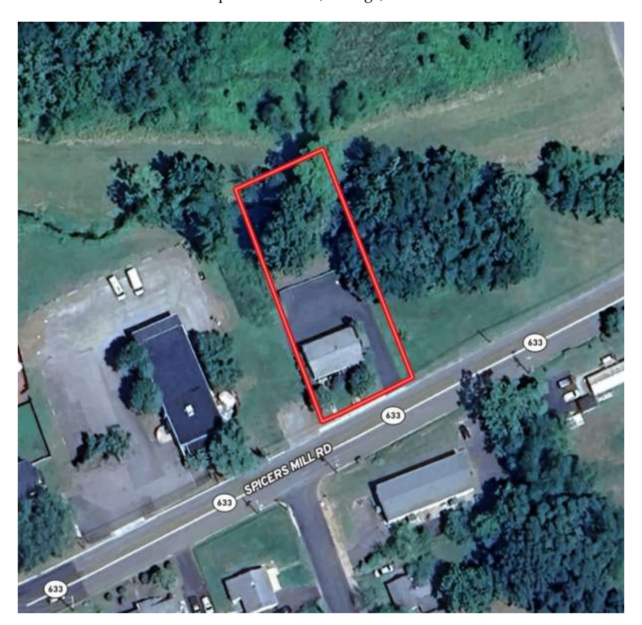
161 Spicers Mill Rd., Orange, VA 22960