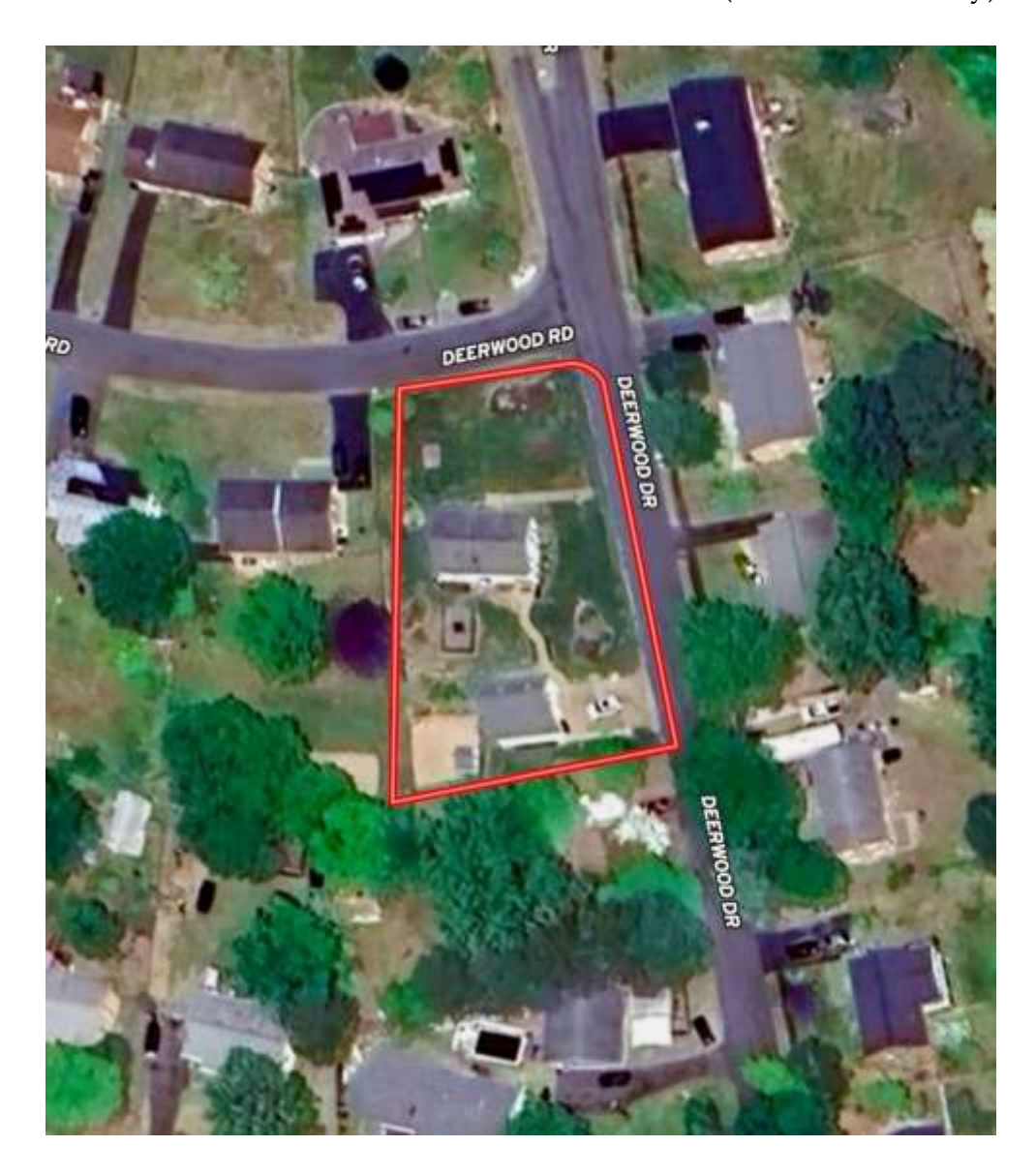
101 Deerwood Road, Charlottesville, VA 22911 -- (Albemarle County)