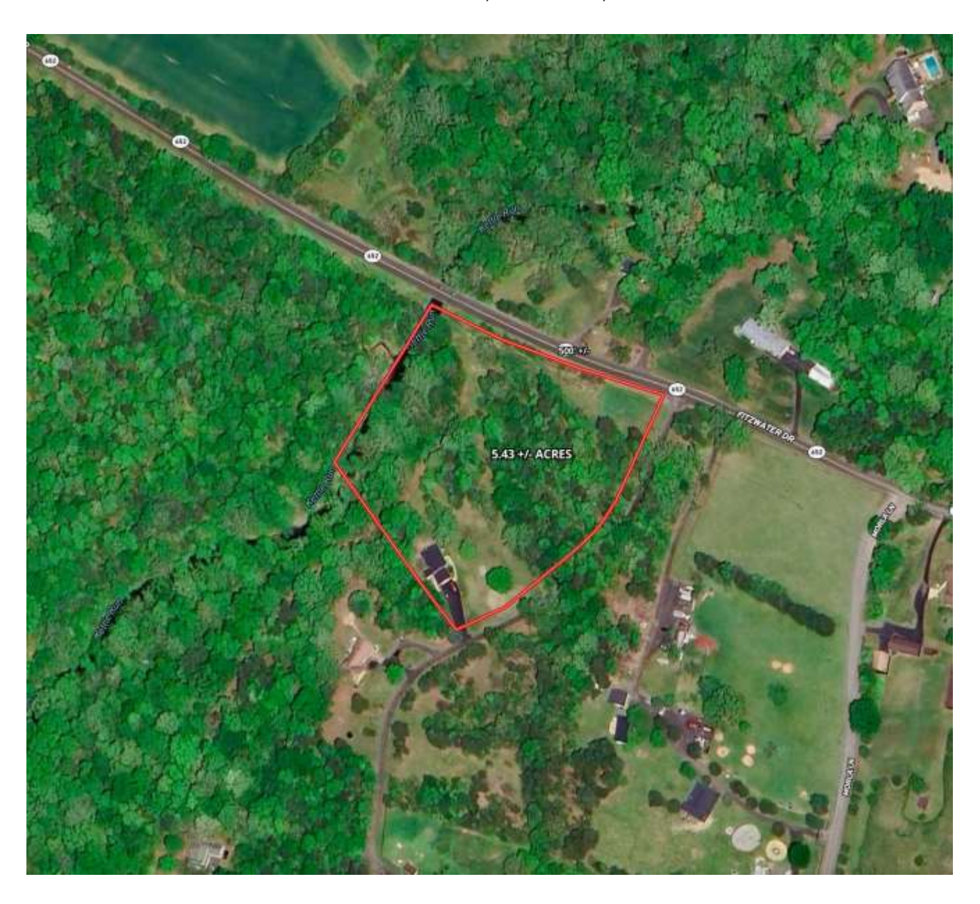
14303 Fitzwater Drive, Nokesville, VA 20181