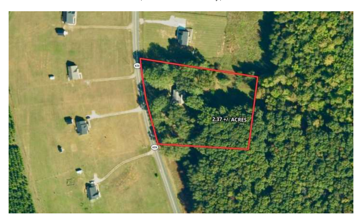
Terms & Conditions

4484 Pin Oak Road, Prospect, VA 23960 (Prince Edward County)