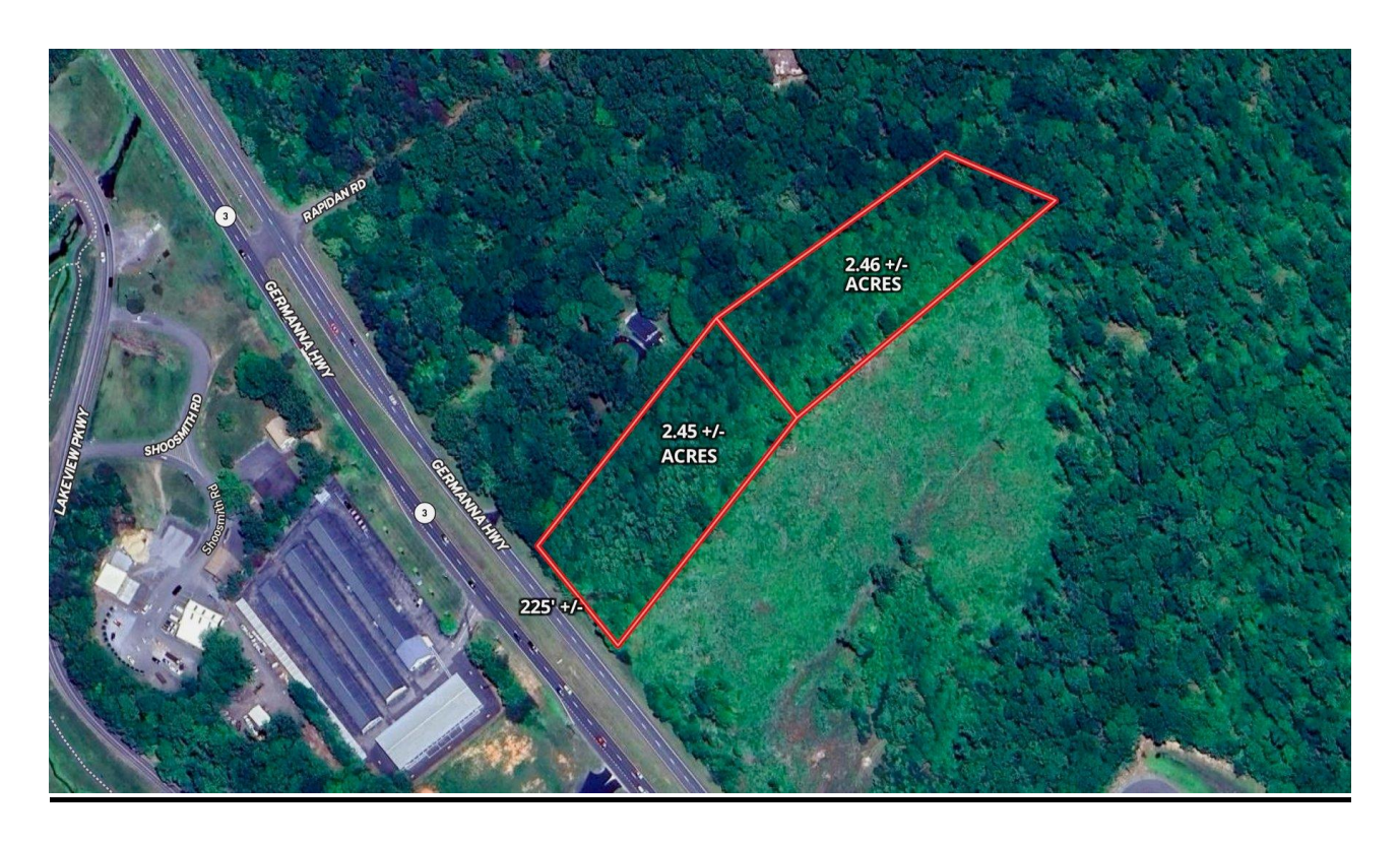
3663 Germanna Highway, Locust Grove, VA 22508 (NOTE: Physical address is for GPS purposes ONLY. Auction property is located adjacent to this address)