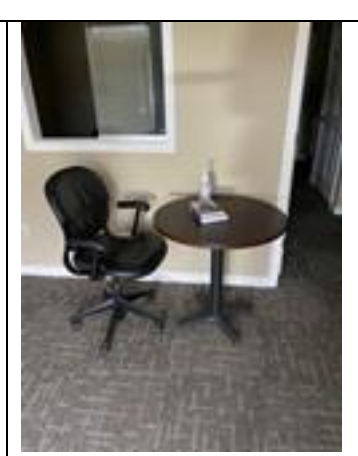
Two desk chairs like the one shown above. Value $50.00 each.