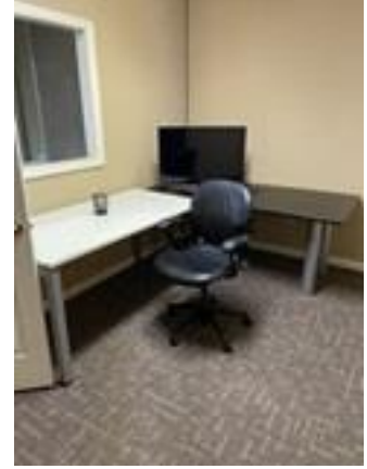
TV/Monitor shown above. Value $50.00.