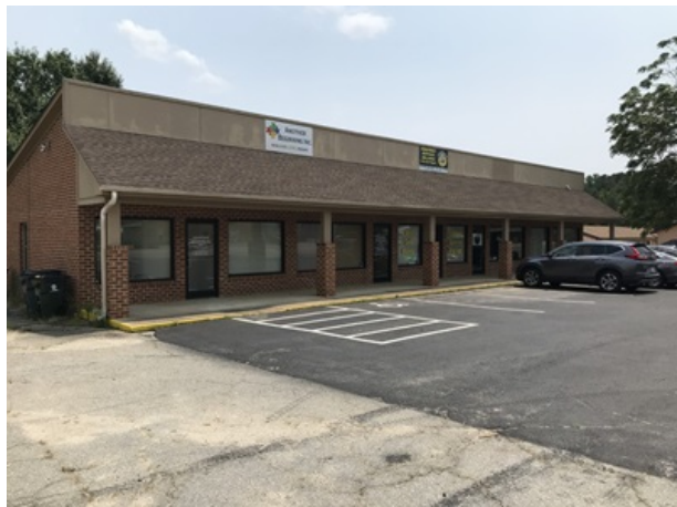
Main Structure Photo