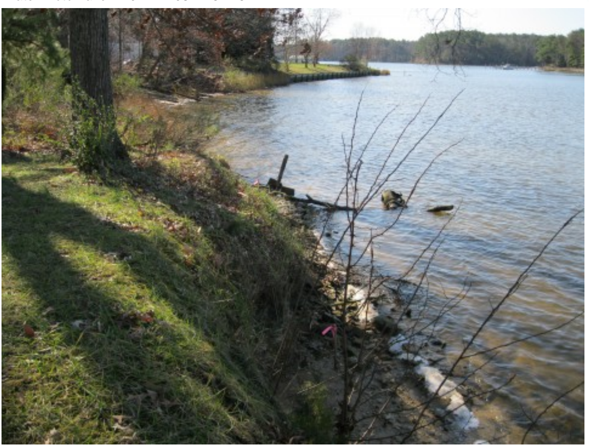
Date Photo Taken: 2011:12:08 12:57:32