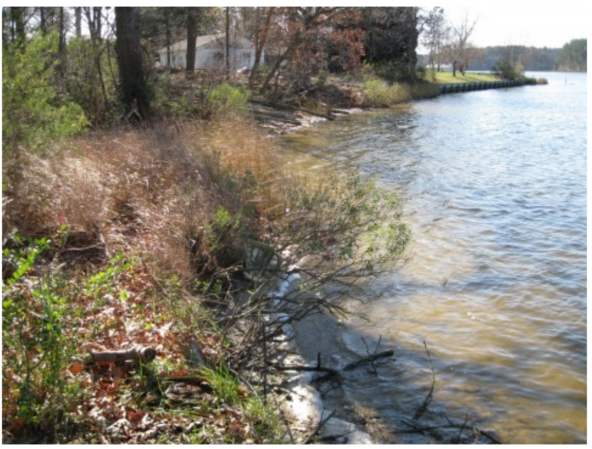
Date Photo Taken: 2012:01:23 12:39:09