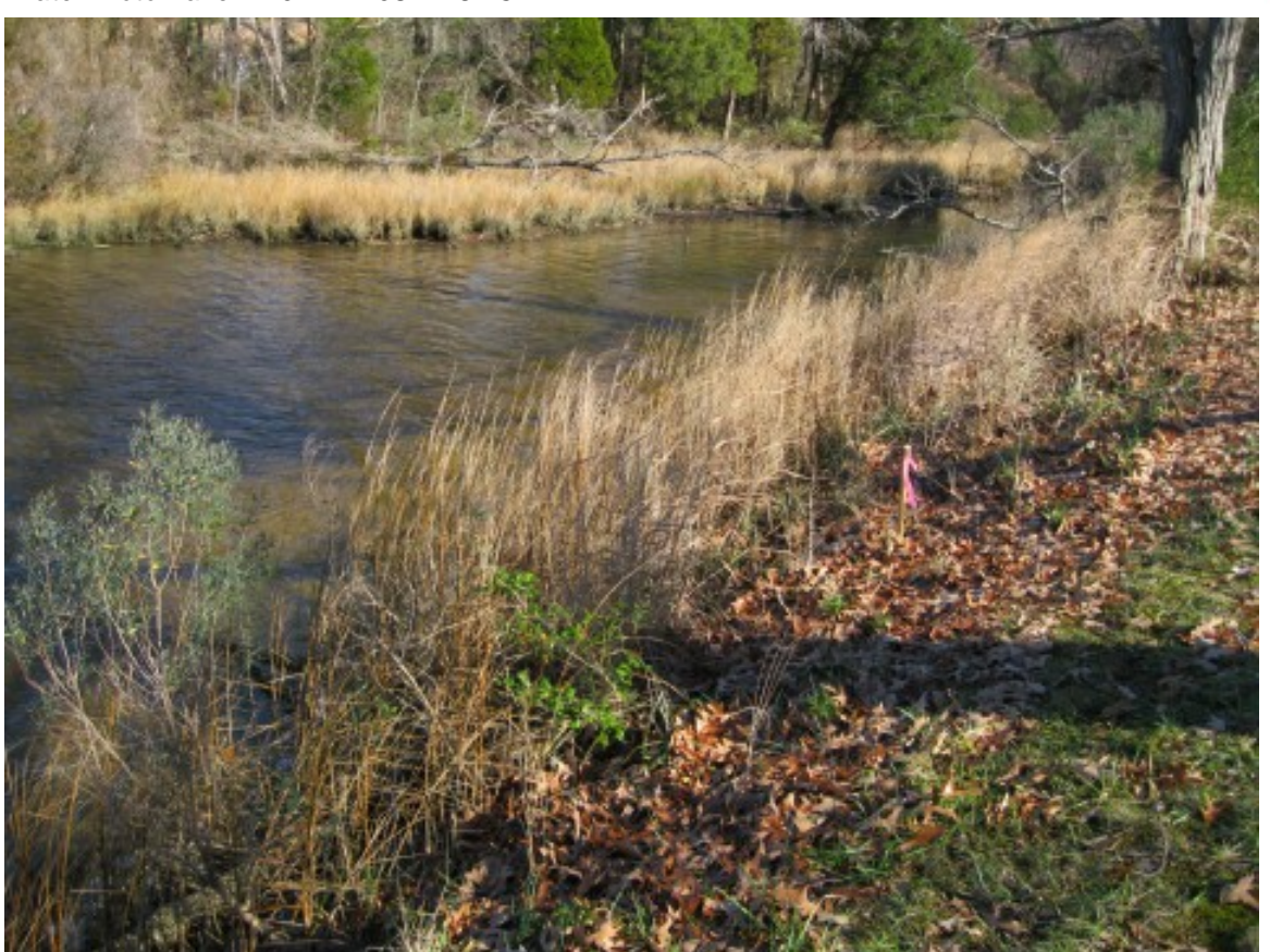
Date Photo Taken: 2012:01:23 12:39:25