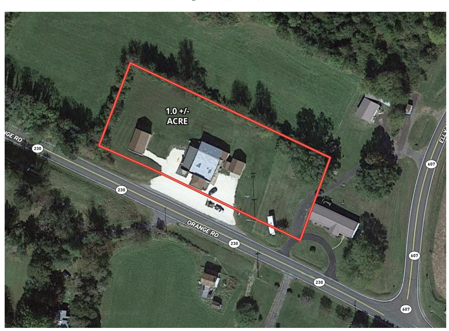
3091 Orange Road, Aroda, VA 22709