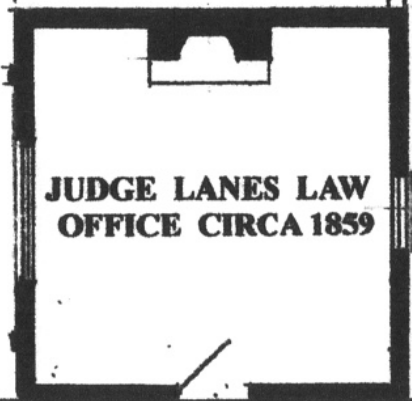
JUDGE LANES LAW OFFICE CIRCA 1859