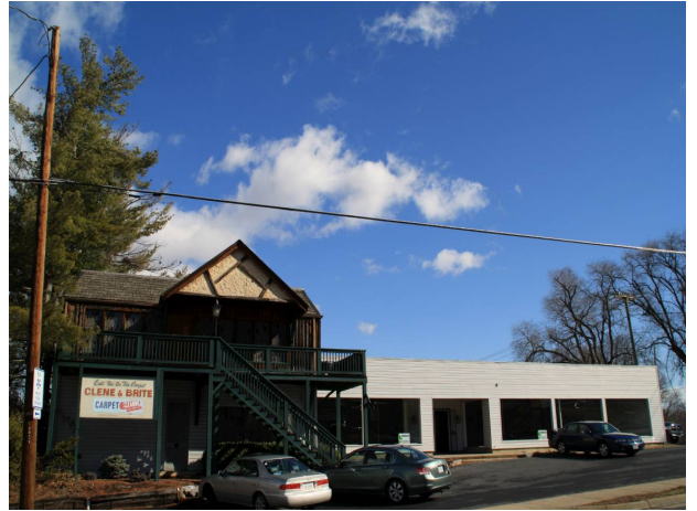
( http://images.vgsi.com/photos/StauntonVAPhotos/A00\00\04\03.JPG )