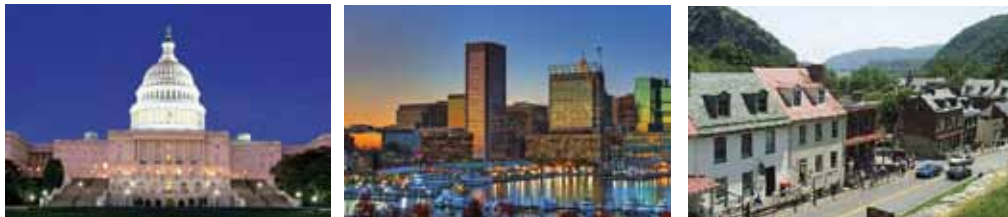
Convenient to DC, Baltimore, and all area attractions.

This Picturesque property is perfect for your farming operation, horse farm or country estate. Enjoy privacy and serenity on this quiet country setting.