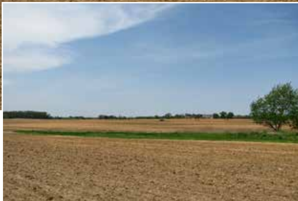
Easy access directly on CR-535