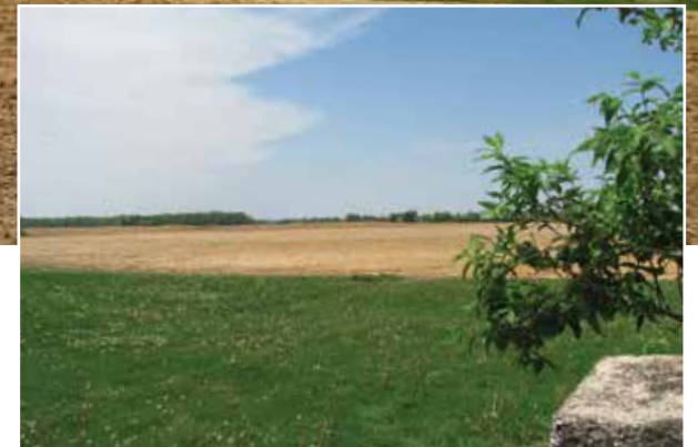
Irrigation + Tillable Acres = Fantastic Yield on What You Sow