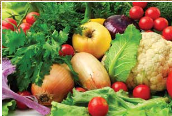
Prime Location to reach all Markets: New York-Princeton-Philadelphia