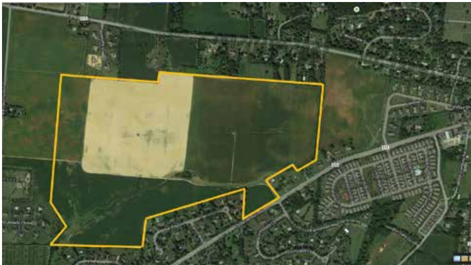
Convenient to Route 130 & NJ Turnpike