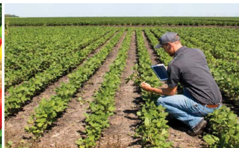
Get Your Crops in this Spring