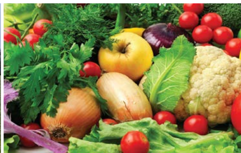
Productive Farm with Fantastic Yield