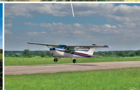
Your Own Private Airstrip