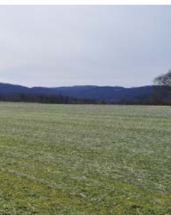
Usually All Tillable Acres