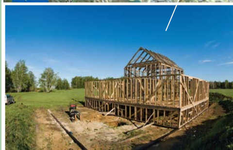
Design and Build Your Dream Home