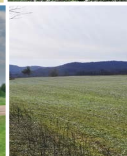
Great Soils and Virt