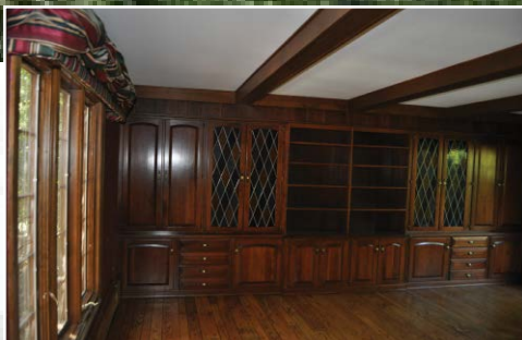
Private library with elegant cherry cabinets