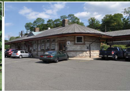
Direct Train to NYC or enjoy dining & shopping in downtown historic Bernardsville