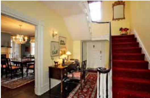
Stately foyer and beautiful molding throughout

~ 65 Kings Highway, Middletown, Monmouth County, NJ 07748