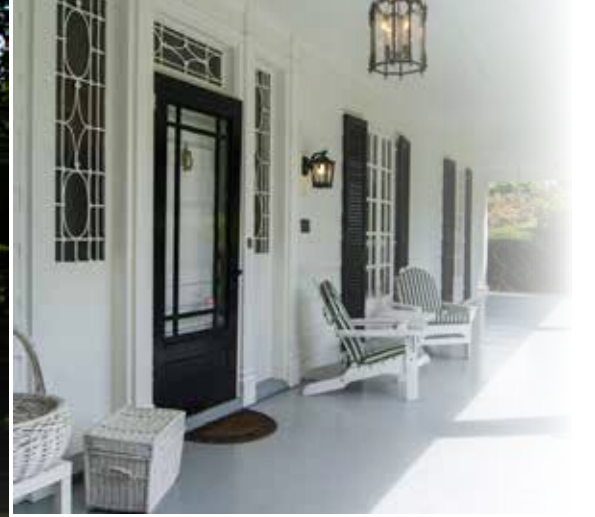
Classic old world charm with Philippine mahogany wrap around porch