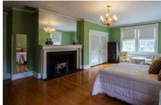
Six spacious bedrooms