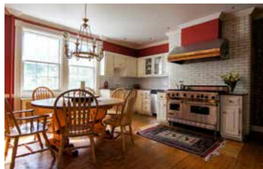
Gourmet country kitchen with Viking six burner range, double oven and granite counter tops