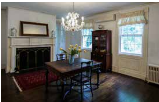
Fireplaces and elegant chandeliers adorn the rooms