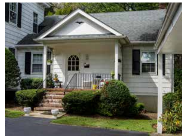
Separate entrance to the office space currently utilized as a 2 bedroom guest suite