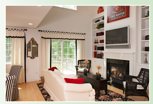
Open Floor Plan Perfect for Entertaining Friends and Family