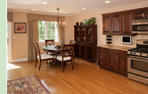
Kitchen Breakfast Nooks with Picturesque Countryside Scenery