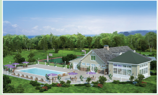
Host Events at the Community Clubhouse