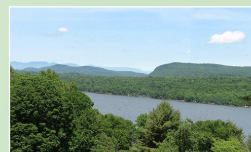
Magnificent Views of the Hudson River and Surrounding Mountains