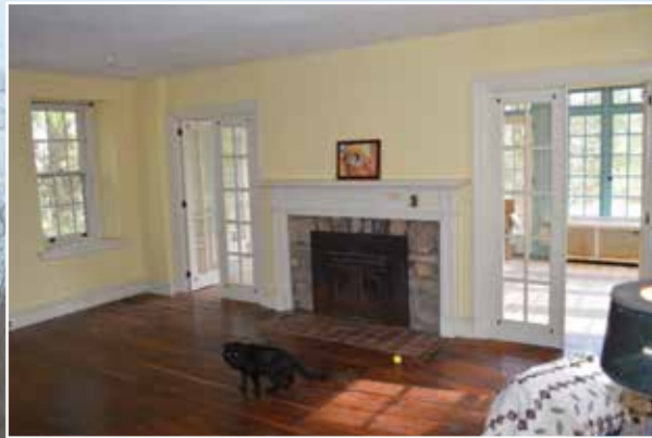
Living Room with Adjoining Solarium