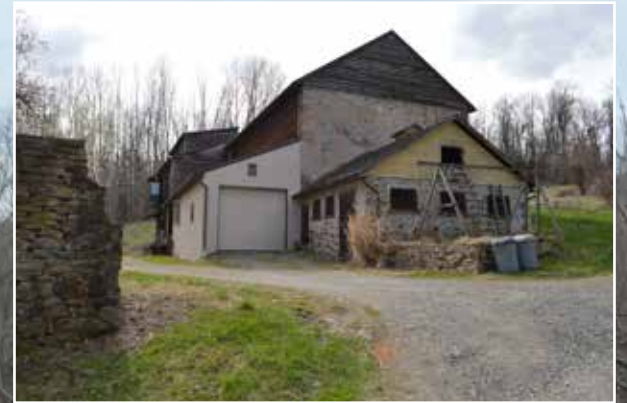
1 Bedroom Apartment