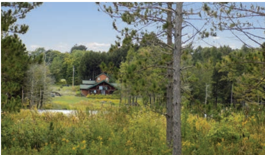
Don't Miss this Fantastic Opportunity!

A licensed NY Real Estate Broker In cooperation with Max Spann Real Estate & Auction Co