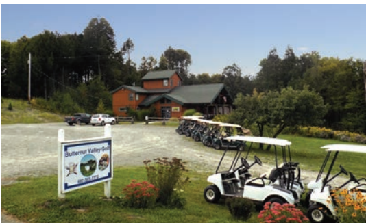
Butternut Valley Golf Course