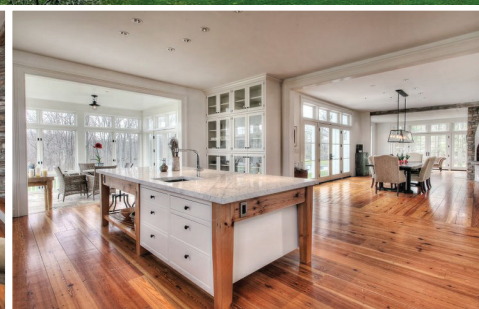
The Ultimate Kitchen for the Discerning Gourmet with Gorgeous 2" Single-Slab White Veined Marble Center Island