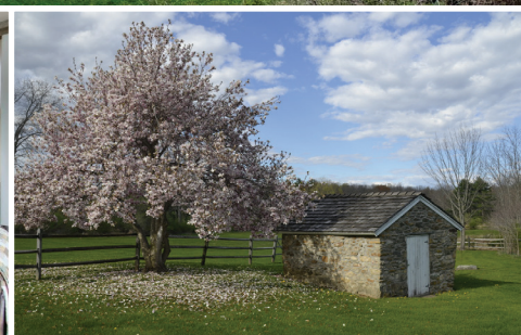
Old Spring House Country Charm