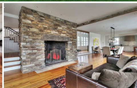
Beautiful Wide-Plank Pine Wood Flooring and Floor to Ceiling Stone Fireplaces