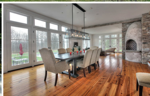
A Perfect Setting for Entertaining with Open Floorplan Dining Room with Beehive Oven