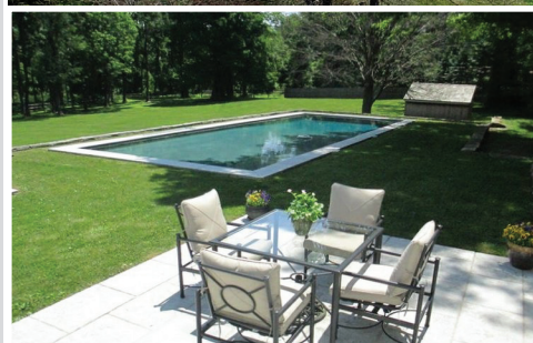
A Short Stroll to the Gunite Pool and Spa

NEW YORK: 252 West 37th Street, Suite 200E, New York, NY 10018 NEW JERSEY: 1325 Route 31, Annandale, New Jersey 08801