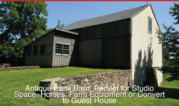
Antique Bank Barn. Perfect for Studio Space, Horses, Farm Equipment or Convert to Guest House