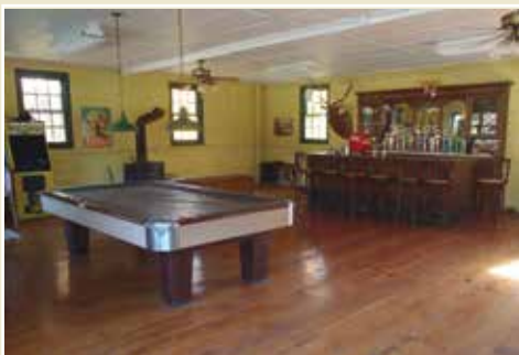
"Man Cave" with Work Shop