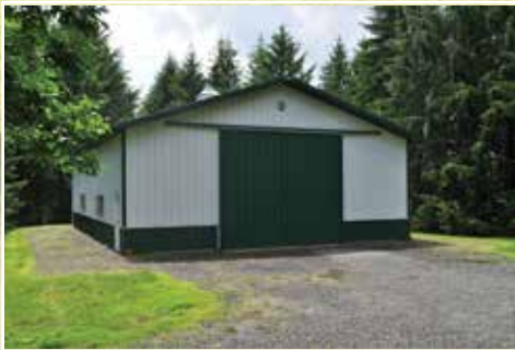
Storage Barn 2,500 + SF