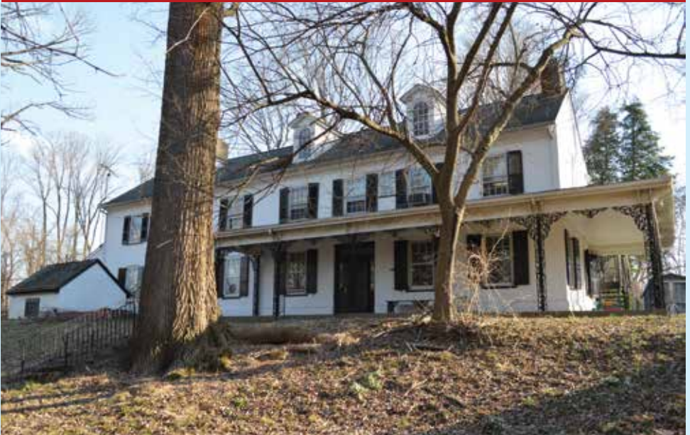
2800 Newportville Rd, Newportville, Bristol Township, Bucks County, PA 19007