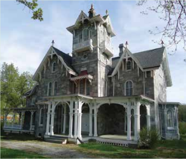
700 Lancaster Pike (Route 30 East), Malvern, East Whiteland Twp, PA 19355

Fantastic High Visibility Location at the Intersection of Routes 30 & 202 Restaurant, Catering/Event Center, Hotel, Day Care Medical, Office – Numerous Uses