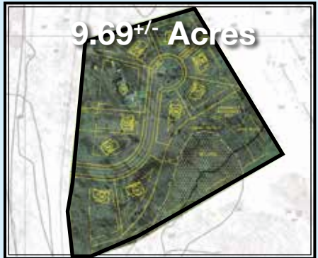
Conceptual Site Plan