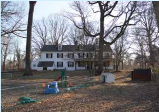
Former Day Care with Spacious Yard