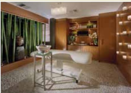
Schedule a Massage Therapy Session