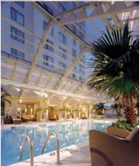
Enjoy a Cool Dip and Relax on the Community Deck