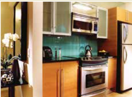
Stylish European Kitchen