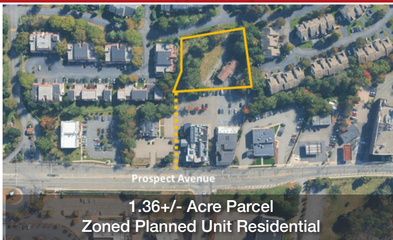
1.36+/- Acre Parcel Zoned Planned Unit Residential