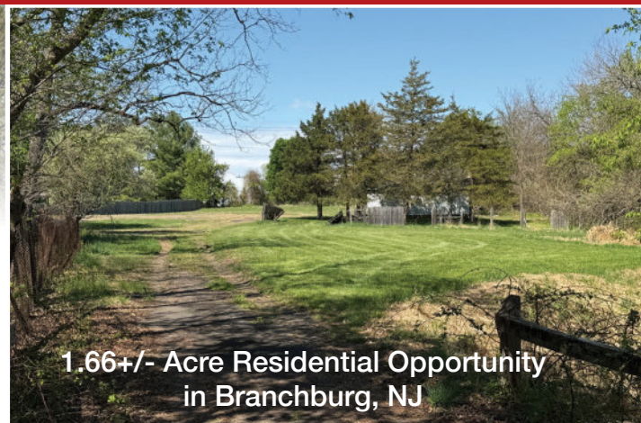
1.66+/- Acre Residential Opportunity in Branchburg, NJ