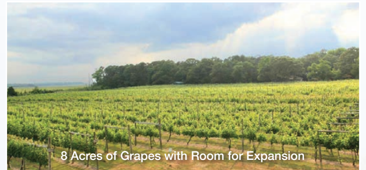
8 Acres of Grapes with Room for Expansion