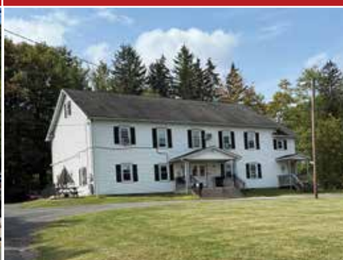
Former Municipal Building on 1.92± Acres