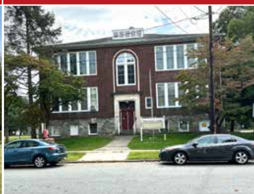
Former Third Street Elementary School on 1.12± Acres