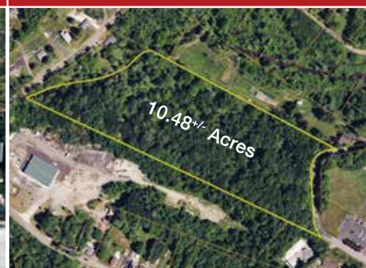
Light Industrial Commercial Lot & Residential Lot