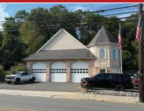
9,184± SF Former Fire Station & Hall

BY ORDER OF OGDENSBURG TWP SUSSEX COUNTY