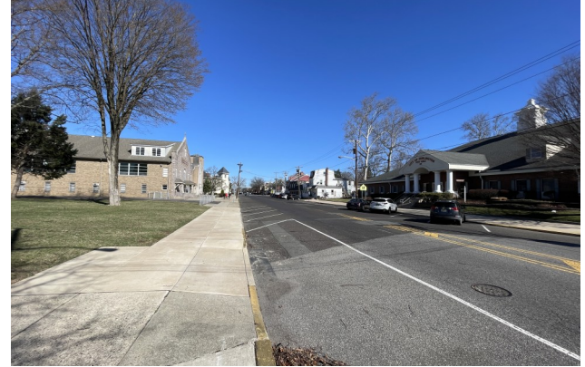
77.33 ft Frontage on High Street

Prime Location! Situated on High Street, directly across from City Hall, providing excellent visibility and accessibility.