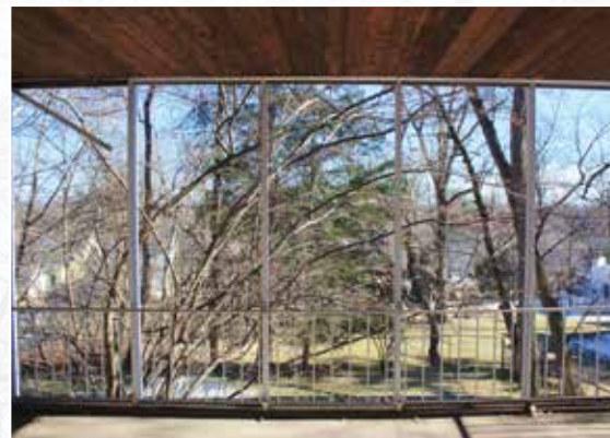
Enjoy the Incredible Views Daytime and Evenings