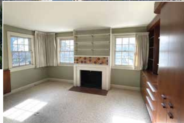
Primary Bedroom Suite with Views, Fireplace, Custom Built-in Cabinets and Ensuite Bathroom