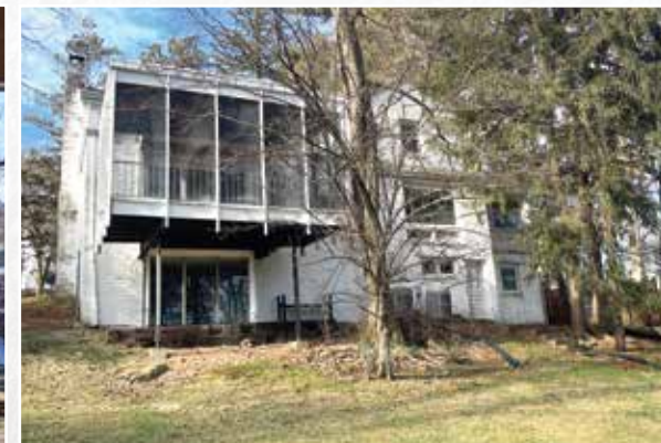
Spacious Fenced Backyard