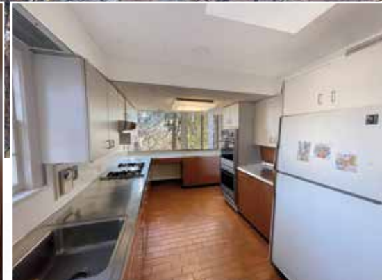
Create Gourmet Meals in the Retro-style Kitchen with Ample Counter Space or Renovate with Your Style and Flair