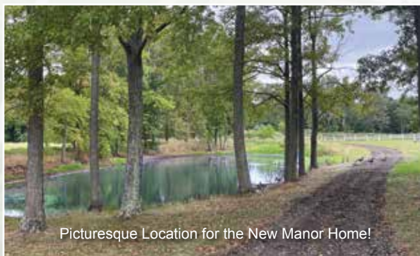
Picturesque Location for the New Manor Home!