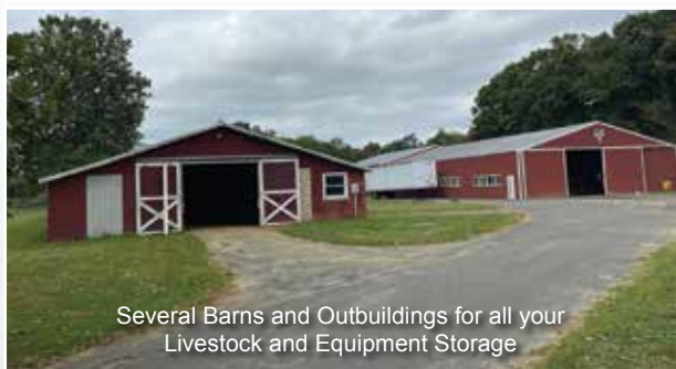
Several Barns and Outbuildings for all your Livestock and Equipment Storage