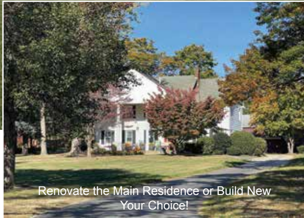
Renovate the Main Residence or Build New Your Choice!